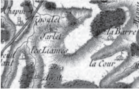
Figure 3.3. The blank space corresponding to the “Île aux fades.” Carte de Cassini, detail of no. 11, feuille 83.