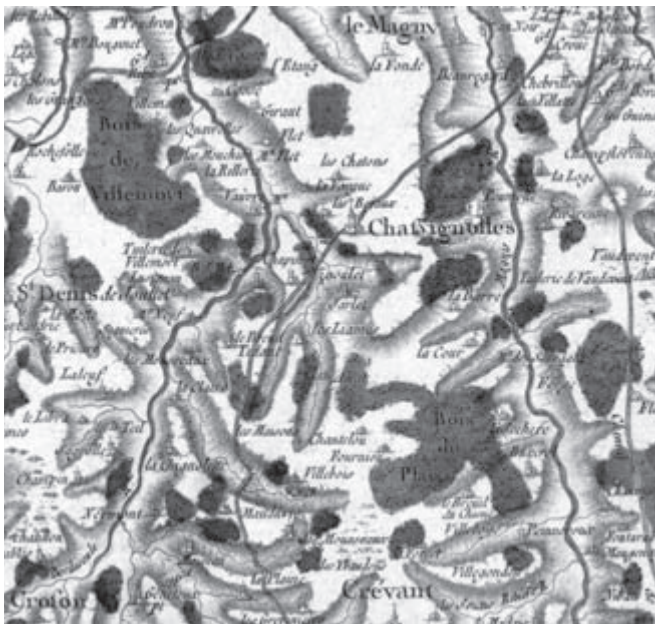
Figure 3.2. The Bois de Villemort, Crevant, and the area around Sand’s fictional “Île aux fades.” Carte de Cassini, detail no. 11, feuille 83.

If, on the level of the novel’s composition, the utopias can be read as closed communities born from the blank spaces of the Cassini map, on the diegetic level the successive places of the novel all share similar narrative fates that taken as a whole suggest a direct engagement with the events of the Commune, all the while reversing its tragic outcome. Whether Nanon’s uncle’s cottage, the “moutier,” Costejoux’s apartment