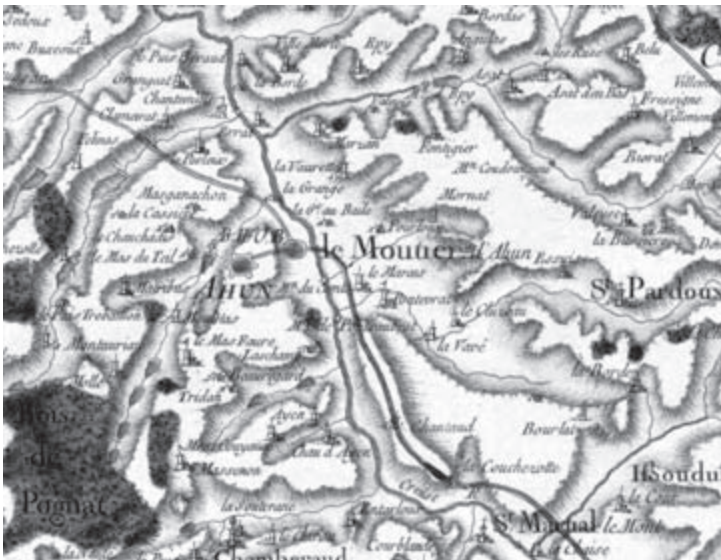
Figure 3.1. Ahun and Its Moutier. Carte générale de la France, dite Carte de Cassini, Detail of no. 12, feuille 56. Courtesy of Library of Congress, Geography and Map Division, G5830 s86 .C3 Vault.

The novel's two principal utopian spaces, Valcreux and the île aux Fades, take on a narrative significance precisely because they exist as cartographic blanks. By their very names, Valcreux being the tautological "hollow valley" and the île aux Fades "fairy island," these fictional places suggest empty and imaginary space, utopian nonplaces. Nanon situates Valcreux very precisely at various times in the novel: "J'avais vu sur la carte qu'à vol d'oiseau, le moutier était à égale distance de Limoges et d'Argenton" (154) ("I had seen on a map that as the crow flies, the moutier was equidistant between Limoges and Argenton"). Early on, one of Nanon's cousins exclaims that at twelve leagues, Saint-Léonard is far from Valcreux (51). Mozet asserts ( Nanon , 28), and a quick look at the Carte de Cassini confirms, that following the novel's indications "Valcreux" would correspond to the village of Ahun, next to the Moutier d'Ahun, which counted 1,850 residents in 1793, and is strangely prominent on the Carte de Cassini for a town its size (see figure 3.1). 14 Ahun is near the geographical center of France, relatively far from any city, and utterly unremarkable except for the almost immaterial, or "hollow," quality of its name, which is composed entirely of vowel and nasal sounds.