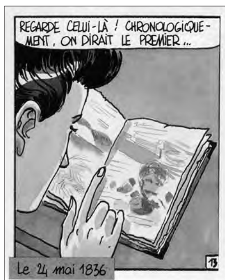
Figure 1.3: The reading of an artist's scrapbooks from the Algerian conquest inspires a colonial genealogical search by a Pied-Noir art student. From Jacques Ferrandez, Carnets d'Orient, vol. 5: Le cimetière des princesses [Oriental Sketchbooks: The Cemetery of the Princesses], preface by Louis Gardel (Tournai: Casterman, 1995), p. 24. Reproduced with the kind permission of Jacques Ferrandez and Editions Casterman.