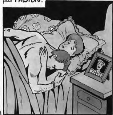
Figure 1.1: Birth and death coincide during the Algerian War, creating a legacy of pain and bitterness for future generations in France. From Farid Boudjellal, Jambon-Beur: Les couples mixtes [Ham-Butter/Arab: Mixed Couples], articles by Martine Lagardette, colors by Sophie Balland (Toulon: Soleil Productions, 1995), p. 5. © Farid Boudjellal.

Et à sa vie sentimentale... Mais elle n'oublie pas FABIEN.