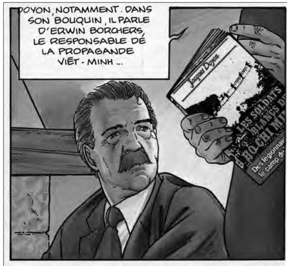
Figure 1.5: A historian's study that documents a mostly forgotten aspect of the French colonial past in Vietnam—how some French soldiers upheld their ideals by leaving the French army and aiding the Vietnamese nationalists and Communists—is depicted in a comic book partially based on that historical publication. From Lax (art) and Frank Giroud (script), Les oubliés d'Annam [The Forgotten Ones from Annam], vol. 1 (Marcinelle: Dupuis, 1990), p. 37. © Lax and Frank Giroud.

Ferrandez, on his publisher's website), 24 in prefatory material or appendices (e.g., Azrayen' , vol. 2, by Lax and Giroud [1999]), or by requesting and publishing a preface by a well-known specialist of the history that the comic book retells. The professional credentials of historians 25 can provide cultural capital and legitimation to a medium that has been described as a “paralittérature” (Couégnas 1992) and is often associated with juvenile distractions, not always of the best variety (cf. Beaty 2007, 2008). For example, Belgian historian Louis-Bernard Koch scripted a pro-colonial comic book, Avec Lyautey de Nancy à Rabat [With Lyautey from Nancy to Rabat] (Cenci and Koch 2007), published by the Editions du Triomphe, whose cultural and historical agenda is on the far right. As I noted earlier, other historians have prefaced books that deal with episodes from colonial history. Ferrandez invited historians Stora and Michel Pierre to introduce two volumes of his “Carnets d'Orient” (in Ferrandez 1994d, 2005a). Stora, of Jewish Algerian heritage and born in Constantine, is a preeminent historian of Algeria, whereas Pierre has published on the 1931 Paris Colonial Exposition, the bagnes [French prison camps] (e.g., in French Guyana), as