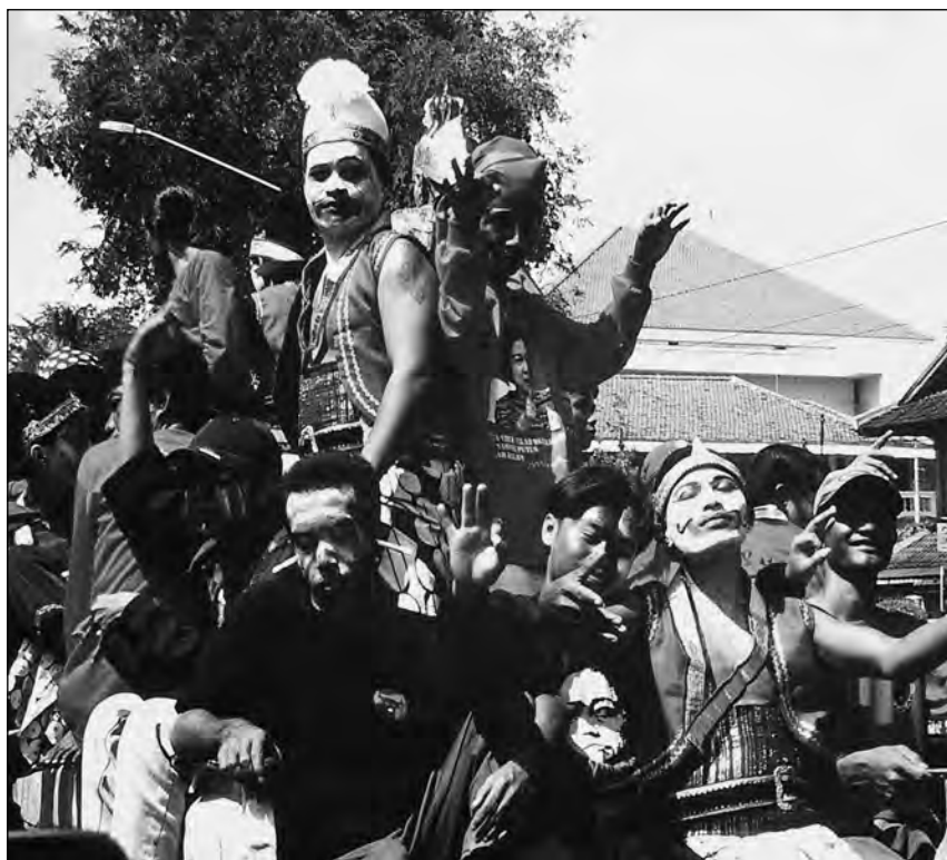
Illustration 15 PDIP election rally, Surakarta, June 1999, with supporters dressed as wayang clowns

Despite such efforts, even in this first election very many Indonesians proved unwilling to accept the political advice of religious leaders and responded positively to Megawati's image as the daughter of Sukarno and the foremost representative of anti-New Order politics. The specifically Islamist PPP had a modest level of support, with 10.7 per cent of the national vote. PAN, led by Muhammadiyah's former head Amien Rais but with a clearly secularist platform, did worse at 7.1 per cent. PKB, headed by Abdurrahman Wahid, gained 12.6 per cent. The big winners were two parties with no special claim on a self-consciously Muslim constituency: Megawati's PDIP, which won fully 33.7 per cent of the national vote and — surprisingly to many — Golkar, which had managed to present itself as a 'new Golkar' and gained 22.4 per cent nationally.