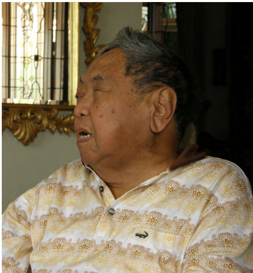
Illustration 16 Abdurrahman Wahid, Ciganjur, October 2009

organisations associated with Muhammadiyah, PAN and other parties were prominent in denouncing Abdurrahman and demanding that he be removed from office. 11 NU's youth activists in Ansor were prepared to defend their kyai with physical force if necessary and attacked Muhammadiyah and Golkar properties in East Java. 12