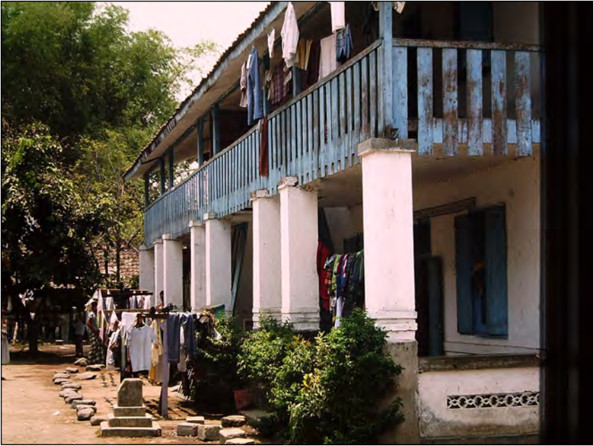
Illustration 8 Tebuireng pesantren , Jombang, in 1987: the oldest building, a dormitory for santris

To their lives centring on piety and pesantren , Java's kyais now increasingly added politics. Following in the footsteps of earlier Modernist activists, from the time of the Japanese occupation onwards many among Java's Traditionalist leaders embraced political leadership roles. The changes brought by the Japanese also gave the kyais final and irreversible victory over their main competitors for control of rural Islam, the formerly Dutch-appointed pangulus . The Japanese recognised how little influence these government appointees had among Muslims and therefore how little use they were to the occupation forces. The kyais were henceforth unchallenged by any other religious leadership group in the Javanese countryside for many decades.