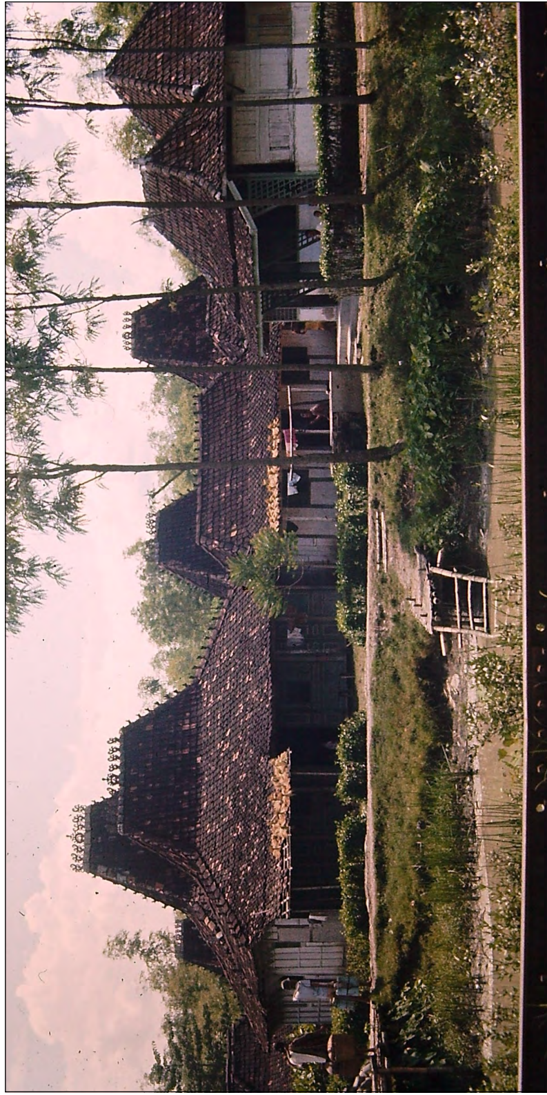
Frontispiece Gajah, a north coast Javanese village, in 1973