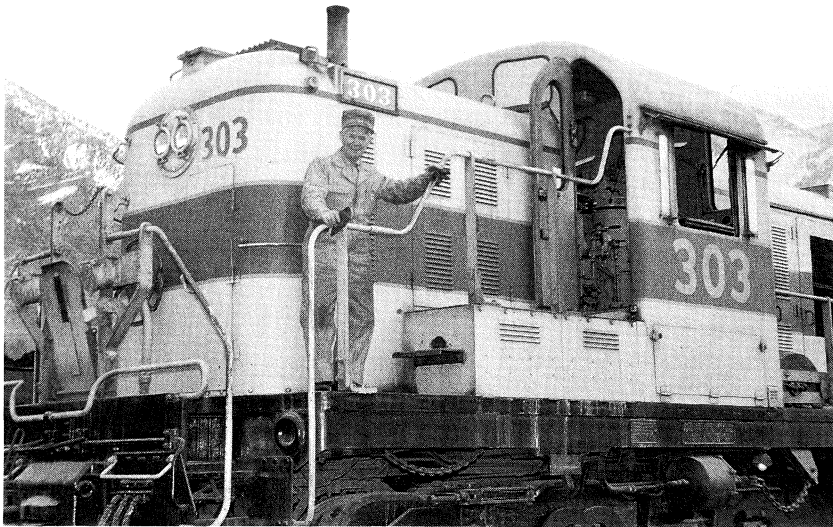
The author in his later years as a diesel engineer for the Utah Railway.

years a much better job than the one I left on the Rio Grande. Instead of being gone from home anywhere from ten hours to ten days or two weeks on a freight trip, as we were on the Rio Grande, on the Utah we were seldom gone more than twenty-four or thirty hours on a mainline trip. And those new engines were marvels compared to the Rio Grande power, which was held together, as we used to say, with bailing wire. For every year of the depression the Utah operated in the black while the Rio Grande was in receivership.