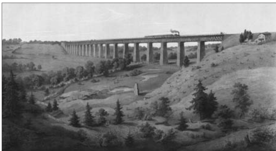
Virginia Museum of Fine Arts, Richmond. The Virginiana Fund .