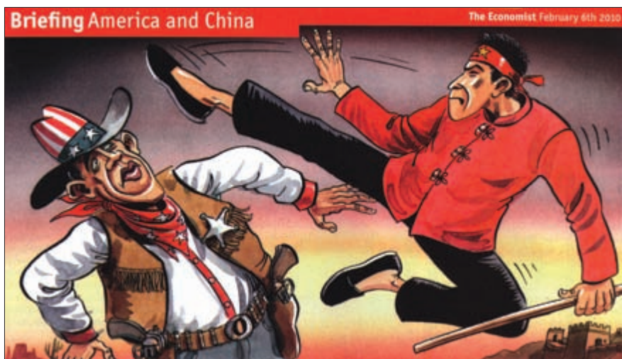
Fig. 10-4. As a metaphor for the changing balance of power between the United States and China, a February 2010 cartoon in The Economist shows President Obama as a cowboy sheriff about to meet the wrath of a kickboxing Chinese warrior.