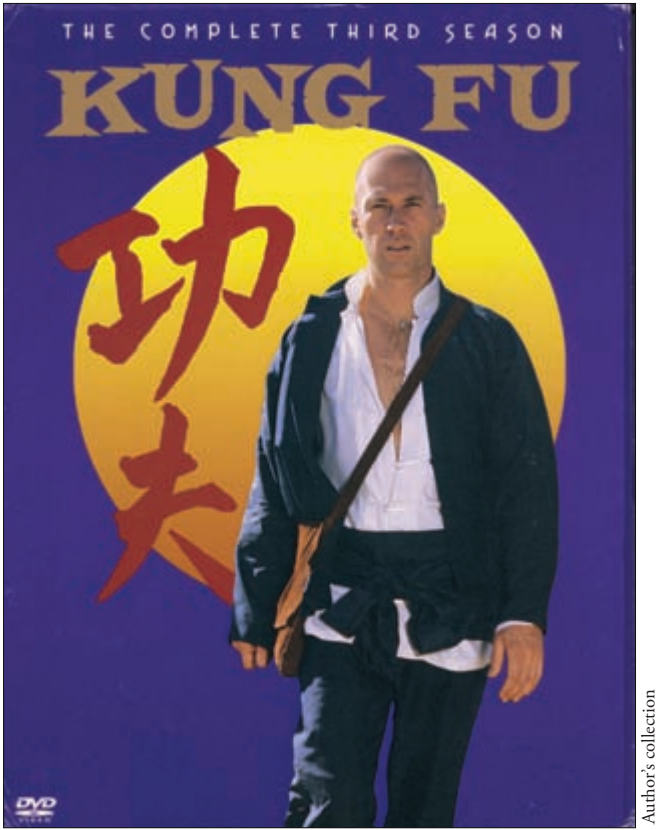
Fig. 9-5. The cover image used on Warner Bros. Entertainment's complete three-season DVD set of Kung Fu features a bald-headed David Carradine as the Shaolin priest Kwai Chang Caine.