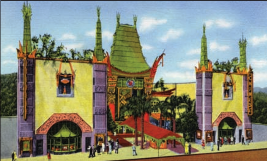
Fig. 9-2. As seen in this 1940s-era postcard, Grauman's Chinese Theatre became a Hollywood icon after its grand opening in 1927.

East itself, which has been the subject and locale of hundreds of Hollywood movies. These included the popular Charlie Chan series of detective films, which, of course, employed highly made-up Anglo-Americans in the lead Asian roles—a racializing of characters now disparagingly called “yellowface.”