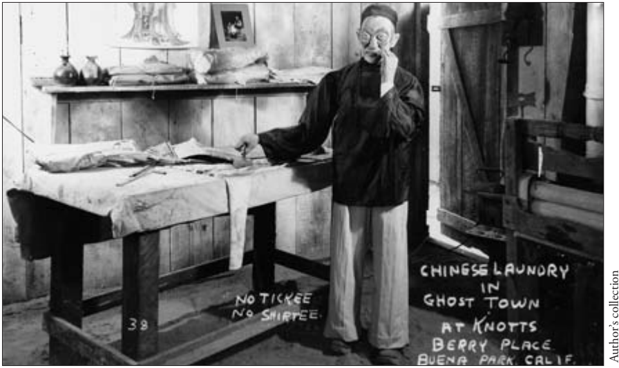
Fig. 9-3. Building on venerable stereotypes, a photographic postcard of the Chinese laundry in Ghost Town, Knott's Berry Farm (ca. 1953) portrays a stereotyped Chinese man.

either by makeup or photographic retouching. People viewing this card might wonder, is he real, or a wax figure?