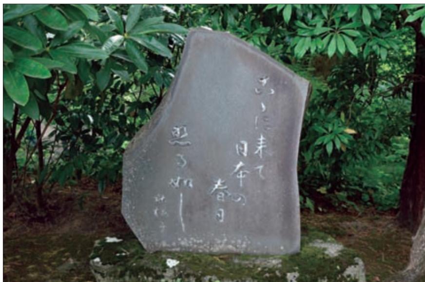
Author photograph, 2010

Fig. 9-7 The Poetry Stone in the Japanese Garden (Portland, Oregon) features a haiku (traditional Japanese poem) reading “Here, miles from Japan, I stand as if warmed by the spring sunshine of home.”