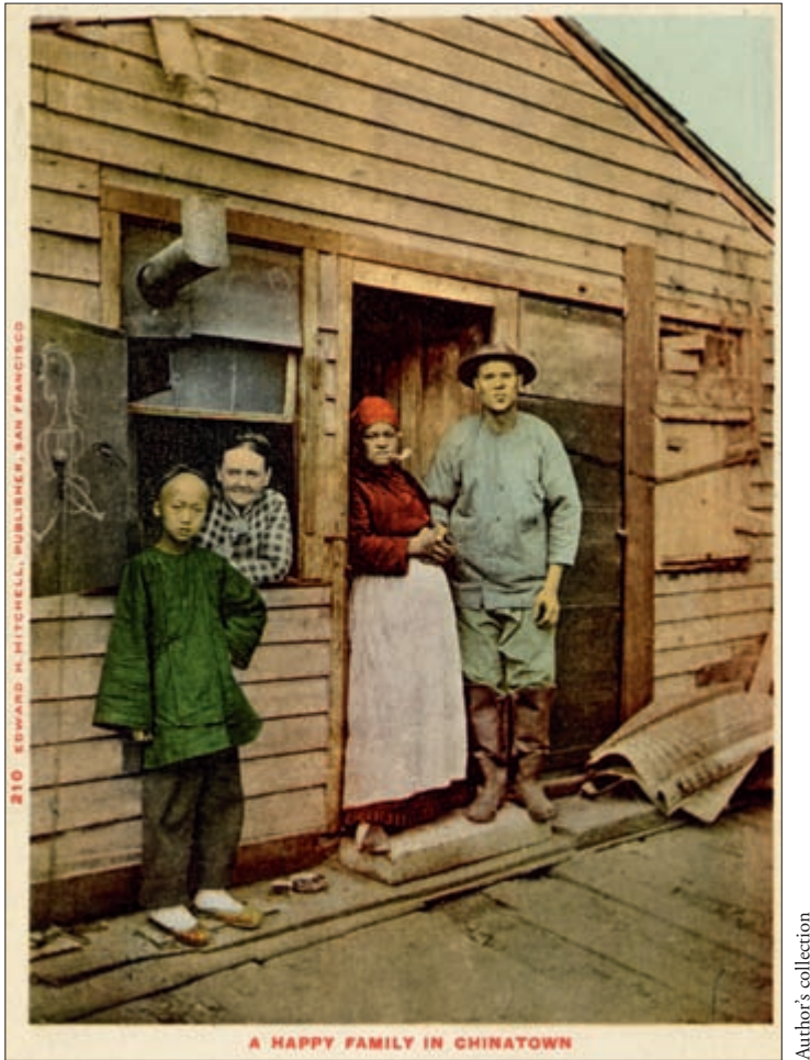
Fig. 5-4. As seen in this postcard of “A Happy Family in Chinatown,” ca. 1906, this part of San Francisco reflected a mix of peoples living in humble surroundings.

Happy Family in Chinatown” (fig. 5-4) builds on that theme, but looking more closely, we see that the family members appear to represent several ethnic groups. On Chinese American menus, “Happy Family” refers to a meal featuring a mixture of chicken, beef, and shrimp as well as vegetables; thus this Happy Family terminology on the postcard suggests an ethnic smorgasbord of mixed races. Moreover, the condition of the home, with its ramshackle siding and jerry-built stovepipe, might have reminded postcard viewers that many of these “happy” families were not well-off. Here we are supposed to interpret the Oriental as both satisfied and acculturating. Throughout the West, however, such seemingly mundane scenes revealed the Chinese family as the “other,” a