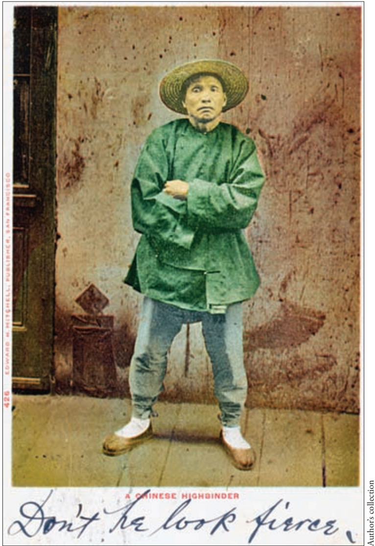
Fig. 5-5. Mailed in 1906, this postcard of “A Chinese Highbinder” contains the provocative inscription “Don’t he look fierce.”

was never actually received, or as the postal mark soberly indicates, “Failed of delivery for want of time.”