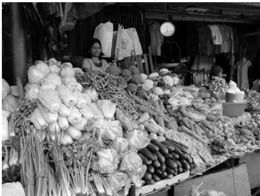
Figure 8.2 A Baguio City Public Market retailer selling upland Baguio vegetables