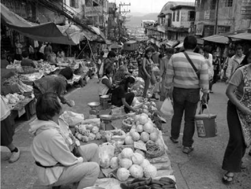
Figure 8.4 Itinerant vendors obtain vegetables on consignment from store retailers and sell their produce in the aisles and streets of the Baguio City Public Market