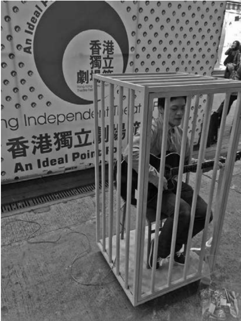
Figure 5.4 Performance on issues of political dissent