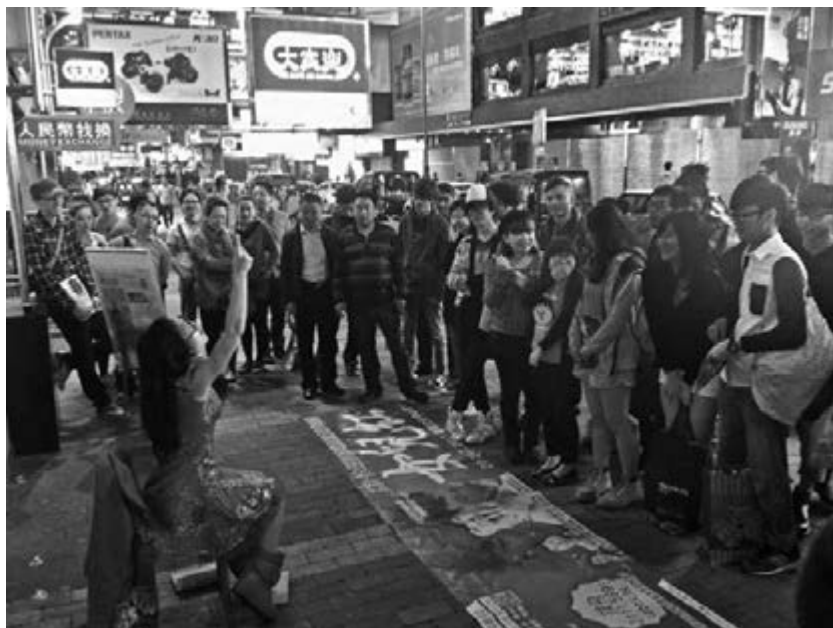
Figure 5.2 Banner on the ground to attract attention