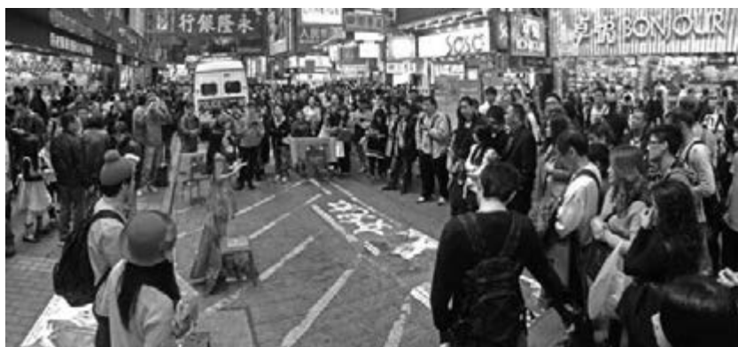
Figure 5.3 Banner on the ground to define the performance area