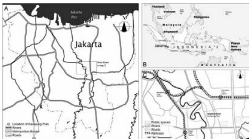
Figure 2.1 Maps of (a) Jakarta, (b) Indonesia, (c) Kampung Pulo