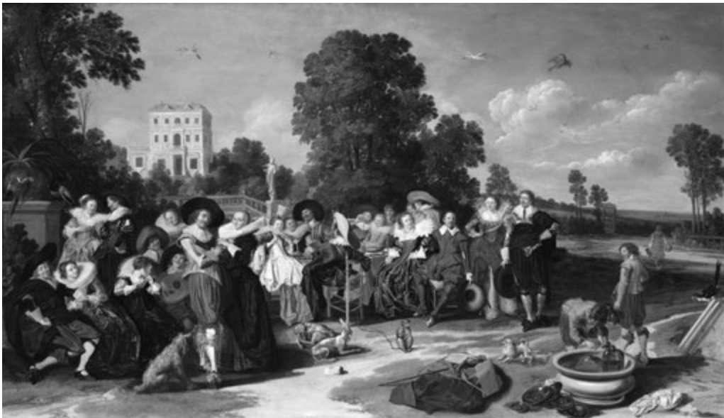
Illustration 9 'Young men and women enjoying the outdoors' in: Dirck Hals, The Garden Party (1627)

In the distinctively stratified society of the early modern period, clothing and apparel were one means by which people could elevate themselves above their social and economic rank in life. However, in the honor-based society of the early modern period, dressing above (or below) one's social station in life was a tricky business. Orphans dressed in black suits with white linen collars set off with red and white borders were recognizable on Sundays in small towns like Woerden and Oudewater. 88 In the larger cities of the Republic burgher orphans residing in municipal orphanages were required to dress in the color of the city so that they could be easily recognized. This made their behavior more controllable, and they could be identified if they begged for