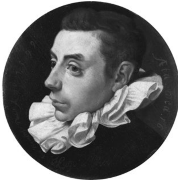
Illustration 4 'Short hair for young men was common around the turn of the century, c. 1600' in: Jan van Ravesteyn, Portrait of Hugo Grotius Aged 16 (1599)

That young people (and people in general) were concerned with their appearance becomes even more obvious in the Alessio Piemontese translation, De Secreteten [The Secrets of Alexis of Piemont] (1636), originally published in Italian. This household manual was published many times throughout the sixteenth century and appeared in Dutch in 1602 and 1635. It contained beauty tips for men and women covering everything from hair removal under the arms to remedies for whitening teeth. One recurring entry is the dyeing of hair. 19