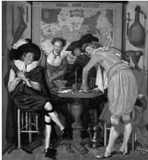
Illustration 8 'Young men dressed in bright-colored yellow and green outfits, silk stockings tapered off with ribbons, and heeled-shoes' in: Willem Buytewech, Merry Company (c. 1620-1622)