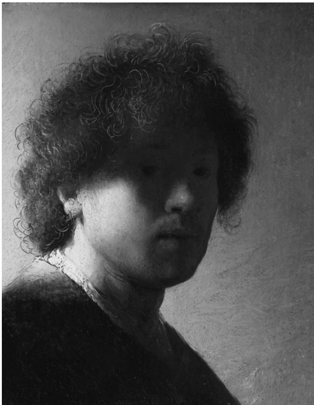
Illustration 3 'A bushy-haired Rembrandt with no facial hair' in: Rembrandt van Rijn, Self-Portrait as a Young Man (c. 1628-1629)