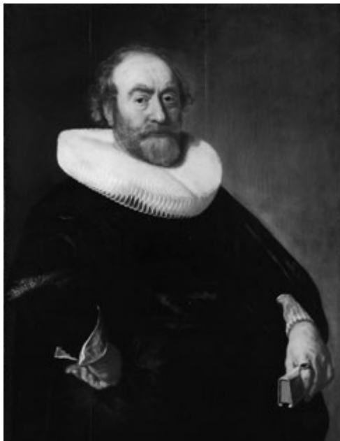
Illustration 6 'Father Bicker, dressed in black and a mill color, wore the fashion of his generation and official attire of his political position' in: Bartholomeus van der Helst, Andries Bicker (1642)

In the Dutch Republic of the early seventeenth century, the craving for glittery clothing made of silk started to take its toll on the environment. According to Constantijn Huygens, the preference for silk in young people's clothing was becoming an environmental disaster. In his sat-