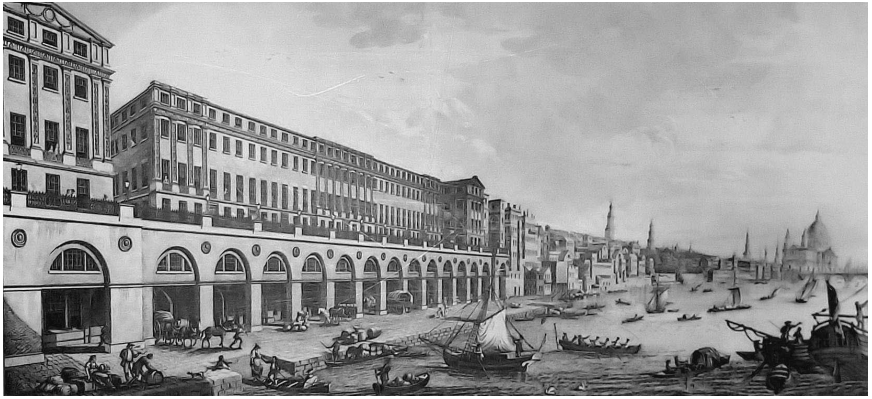
The Adelphi (1780)