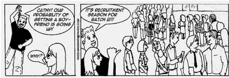
Figure 5.1 Callwork comic strip creator Hazel Manzano illustrates how call centers create opportunities for social, sexual, or romantic encounters between coworkers. (Copyright Hazel Manzano)

employees' perception of their workplace as one where they can seek and find sexual partners with relative ease.