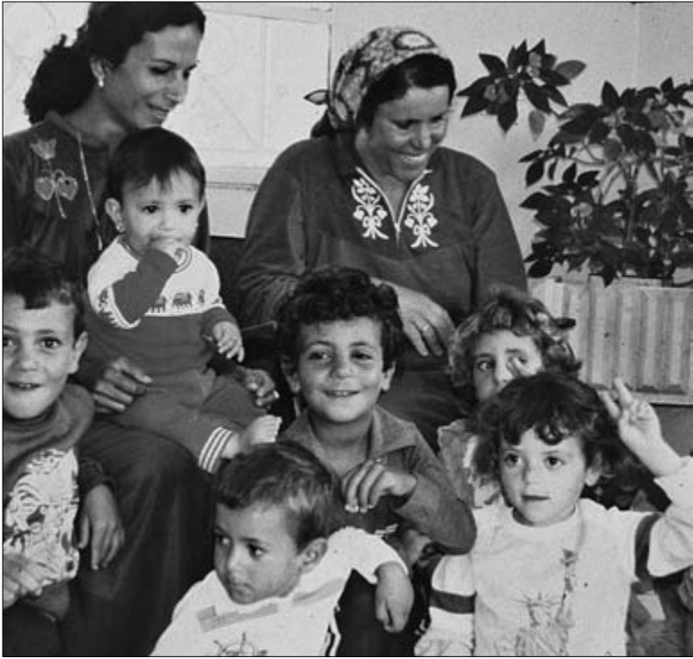
Kufr Nameh village activists, 1991.

Instead, we see that women's issues, which are viewed as potentially divisive, are more severely circumscribed when there is greater pressure for political unity and especially for inter- and intra-factional national unity. For example, the period of the intifada , which Ted Swedenburg (1995) characterizes as one of national conformism, stands in sharp contrast to 1985, when the rapprochement among the various factions of the PLO had not been realized. This earlier pre- intifada period happens to be precisely when Joost Hiltermann conducted his interviews with women activists, in which an unnamed leader of the UPWC (who I could later identify as Maha Nassar) definitively proclaimed: