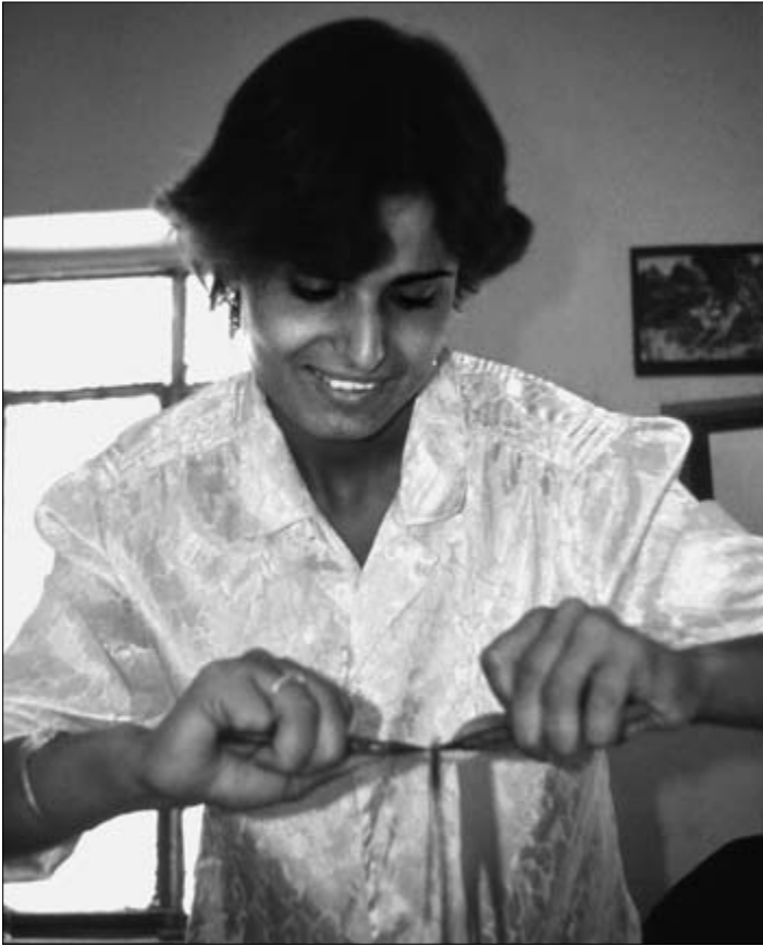
Women's Action Committee ceramic workshop, Issawiyeh, 1989.

they took on a life of their own and became an avenue for women's empowerment. This was particularly the case for the women's economic cooperatives that were formed in the countryside and refugee camps.