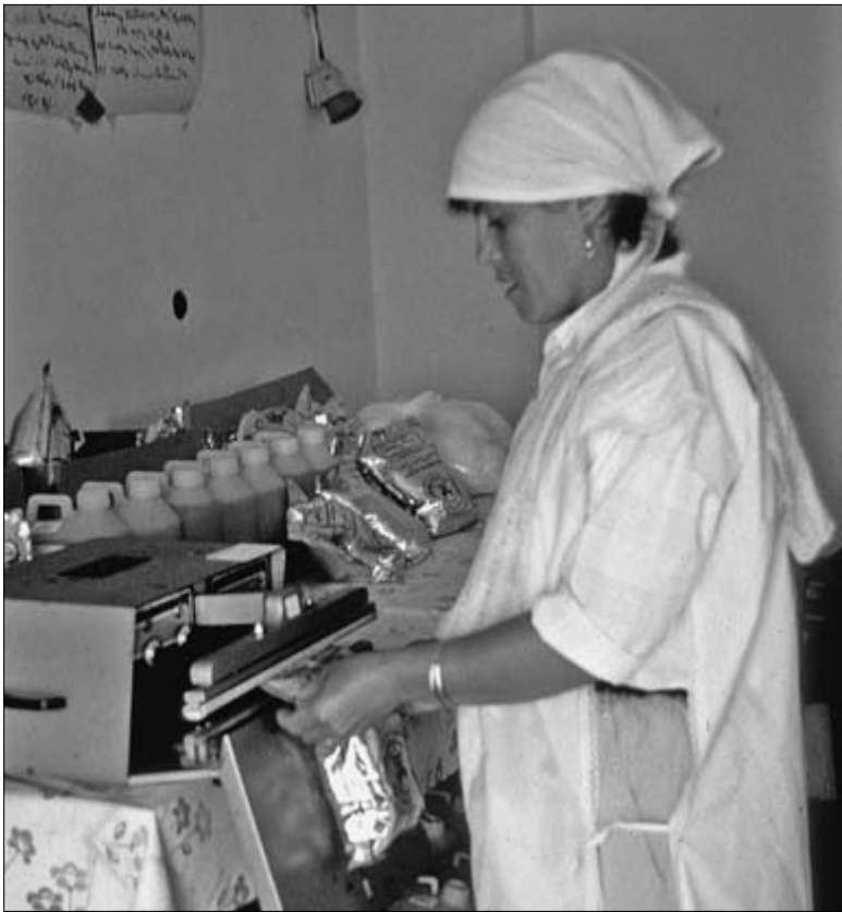
Union of Palestinian Women's Committees canning project, Saer, 1991.

the society is achieved. It means that we will have to go on both sides; to make our activities . . . all together to make—our nation. To end occupation and to have our independent state. 8