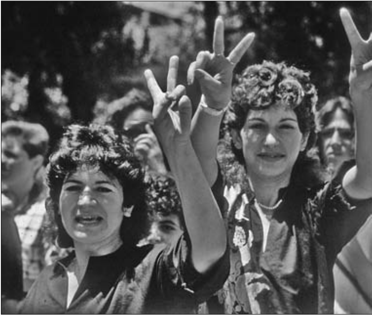
A demonstration of women activists, 1991.

society that discriminated against them. . . . Our leaders [in the DFLP] told women members to mobilize into the VWC and then to recruit them into the political party. . . . The reason that most of the women were reluctant to join the VWC was because it had mixed membership. . . . We discussed this issue with our leaders, who redirected us to cooperate with the women's charitable societies. . . .