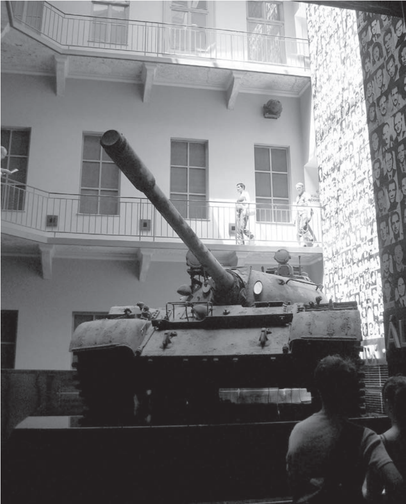
FIGURE 5. House of Terror Courtyard with Soviet tank and wall of victim photos.

and no one stepped into their shoes,” from Imre Kovács—and make up for the lack of other text and information; however the quotes are in Hungarian, and there is no translation. An information sheet accompanies each room, for those willing to seek the information out, but otherwise the museum is striking in its lack of textual information, especially for the non-Hungarian visitor. While it is not necessarily unusual for a Hungarian museum not to have