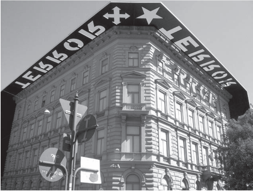
FIGURE 4. House of Terror exterior.