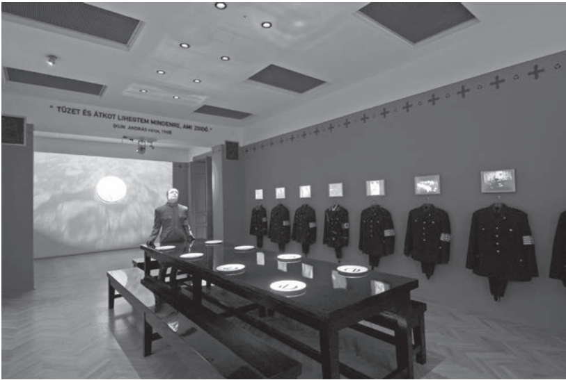
FIGURE 6. Arrow Cross Assembly Hall exhibit on Hungarian Fascist Party collaboration with Nazis.

Photo by http://thomasmayerarchive.com .