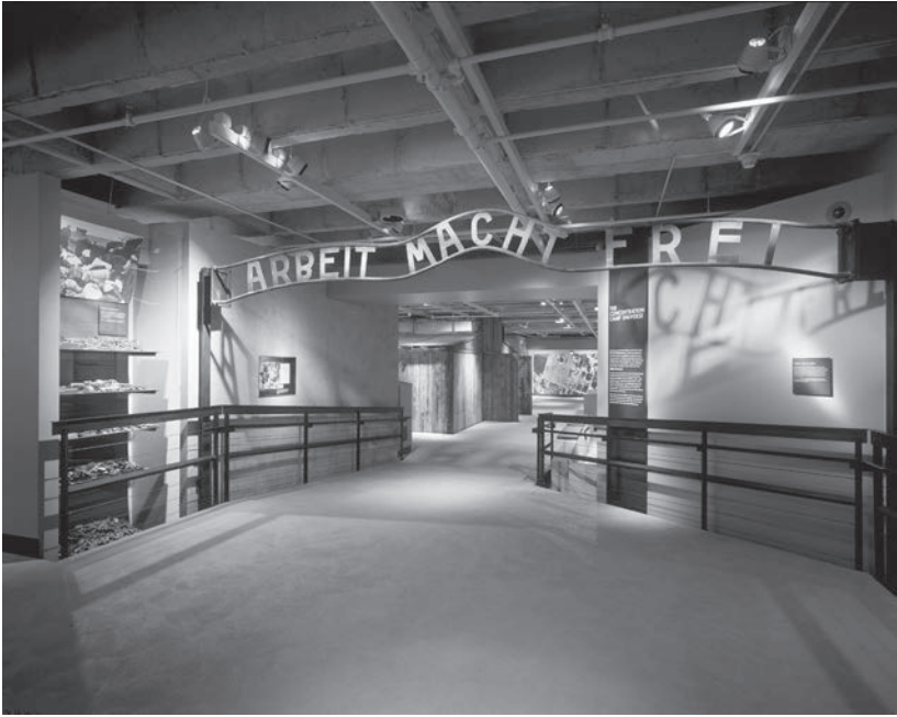
FIGURE 3. View of a casting taken of the gate to the main camp at Auschwitz with the sign “Arbeit Macht Frei” (Work Makes One Free) that is displayed on the third floor of the permanent exhibition in the US Holocaust Memorial Museum. US Holocaust Memorial Museum.

asking “Why Wasn’t Auschwitz Bombed?” Puzzling over the indifference of the US government, the visitor is relieved to descend once more, this time into the “Last Chapter.” The second and final floor is devoted to the defeat of the Germans, resistance and rescue, and the redemption of the victims. Displays on the rescue of European Jews, footage of the Nuremberg Trials, images of Jewish immigration to the United States, and a triumphant display on the founding of Israel allow the visitor to leave on a cautiously positive note. While the horror is overwhelming, democracy and liberty have prevailed in the end, and the visitor leaves the exhibition confident that the whole Holocaust story has been told and that good has triumphed over evil.