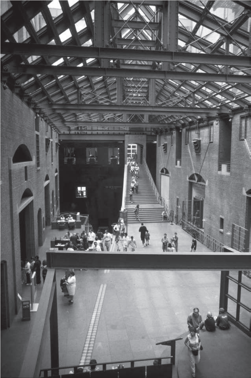
FIGURE 1. Visitors in the Hall of Witness at the US Holocaust Memorial Museum.