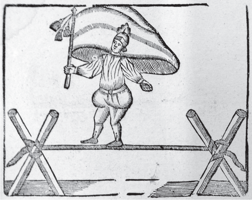
Figure 1. Tightrope dancing with balancing prop from Trondheim, 1751. Detail from a poster by De kinesiske kunstnere (The Chinese artists), 1751.

Established European theaters would seldom hire an artist who was not within their closed circuit, and consequently, many ensembles had to move regularly in order to find work. Some probably preferred this, but others likely went in search of a safer or more stable work environment.