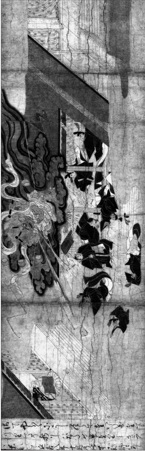
Figure 2. Sugawara no Michizane as shown in Nichizō's Journey to Hell, from Illustrated Legends of the Kitanō Tenjin Shrine. Japan, Kamakura period (1185–1333). Late thirteenth century. Set of five handscrolls; ink and color on paper. (b): 11 5/16 in. x 28 ft. 3 3/4 in. (28.8 x 763 cm). Fletcher Fund, 1925 (25.224. b). The Metropolitan Museum of Art, New York, NY, U.S.A.