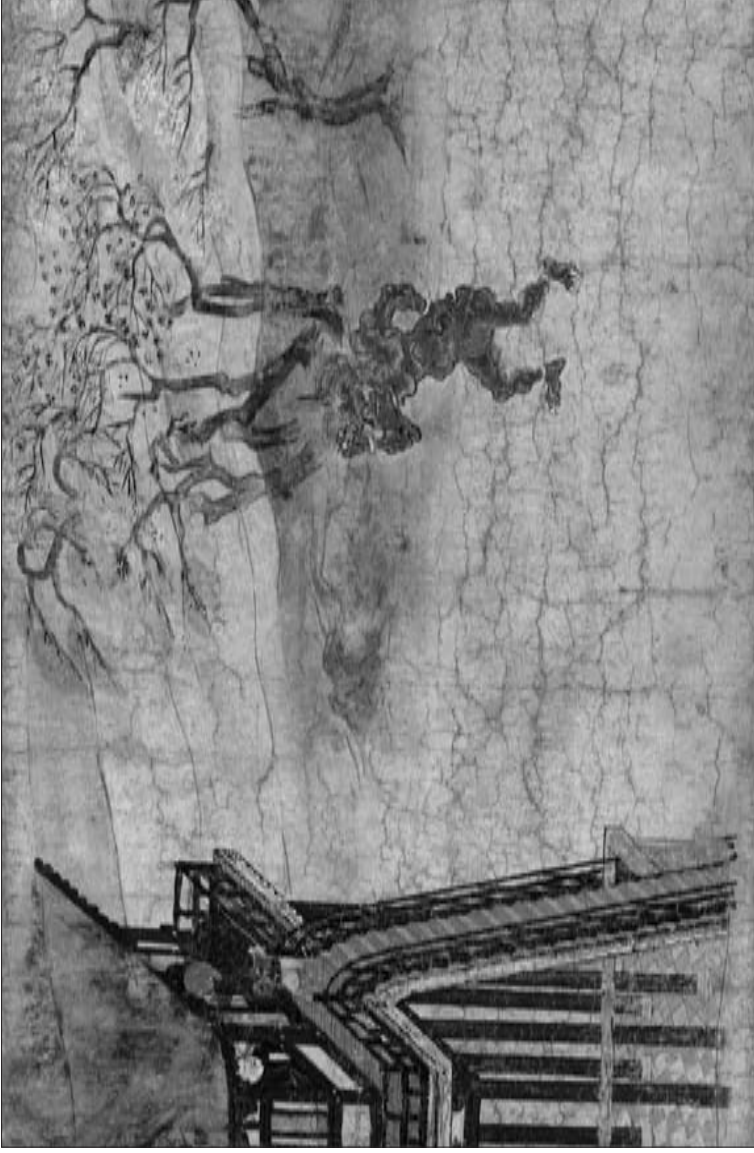
Figure 1. An oni. Artist Unknown, Japanese. Minister Kibi's Adventures in China , Scroll 2 (detail), Japanese, Heian period, 12th century. Handscroll; ink, color, and gold on paper; 30.04 x 458.7 cm (12 5/8 x 180 9/16 in.). Museum of Fine Arts, Boston, William Sturgis Bigelow Collection, by exchange, 32.131.2.