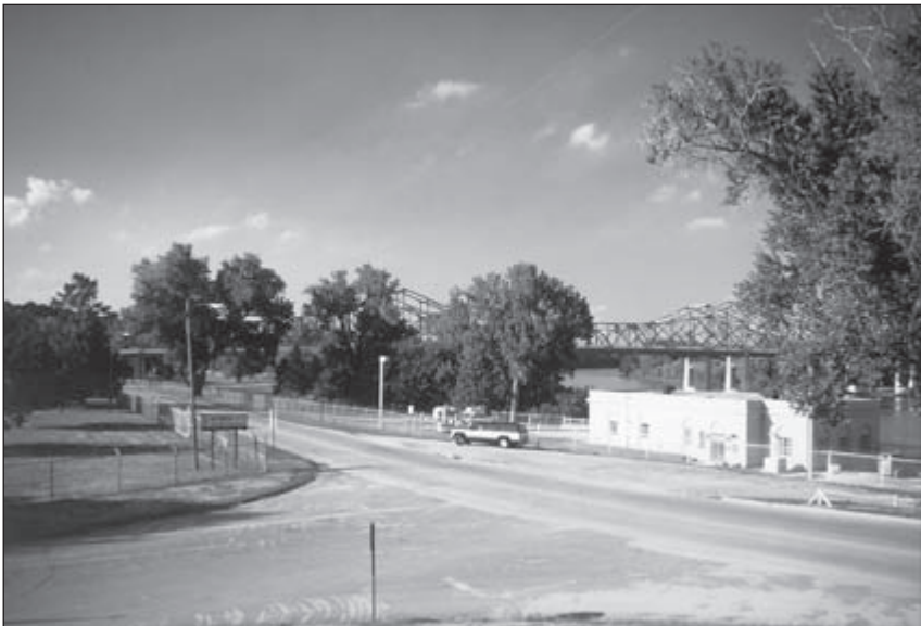
FLORENCE LANDING SITE—Today

Today the site is partially occupied by the water company. Part of the old landing area is thought to be near the right edge of the picture.