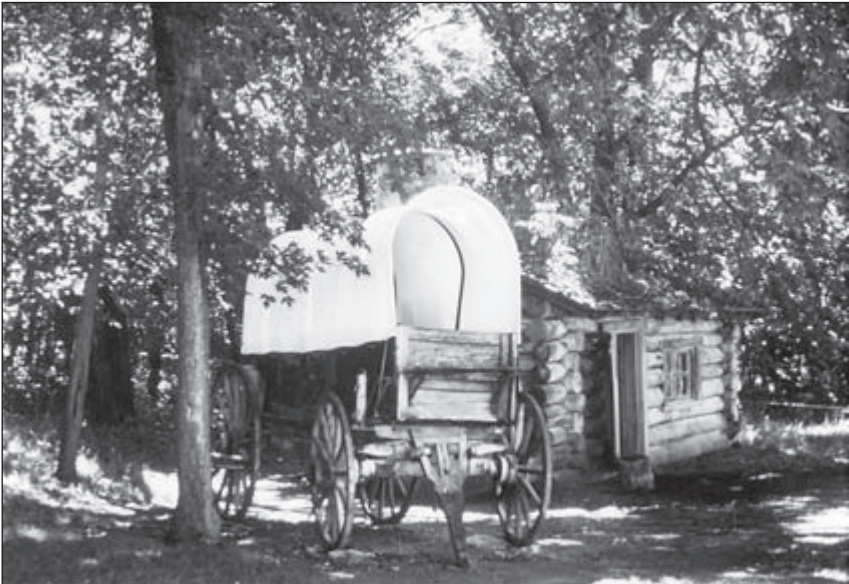
WINTER QUARTERS CABIN—Reconstruction Today

reconstruction of a similar log cabin is part of the Mormon Winter Quarters Visitors Center.