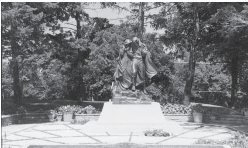
WINTER QUARTERS CEMETERY AND MEMORIAL—Today

statue depicts a mother and father bidding their final farewell to their young child whom they are burying in a shallow grave in the frozen ground. If you stand in the right spot on the right side facing the statue, you will even see a tear on the mother's face. This very moving bronze statue depicts both the suffering endured and the strength shown by the Mormons. None of the specific graves of the early Mormons is marked, but the names of more than three hundred are listed on a bronze plaque. The new Mormon Trail Center is nearby.