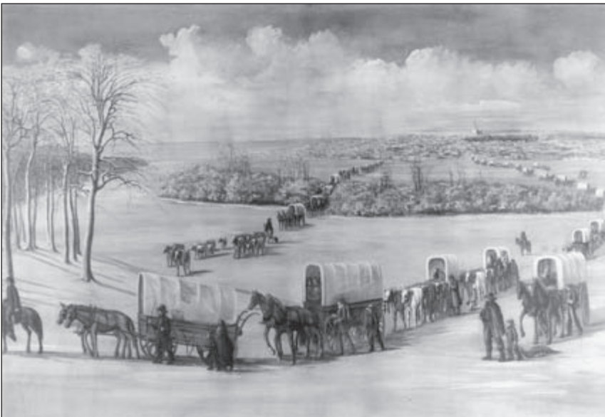
EXODUS FROM NAUVOO—Christensen, Museum of Art, Brigham Young University

Below is a painting by C. C. A. Christensen depicting the route taken by many of the Mormons when they were forced to leave Nauvoo in 1846. Fortunately, the winter was so cold that for a short time the Mississippi River froze, and many of the Mormons were able to drive their wagons and teams safely across the ice.