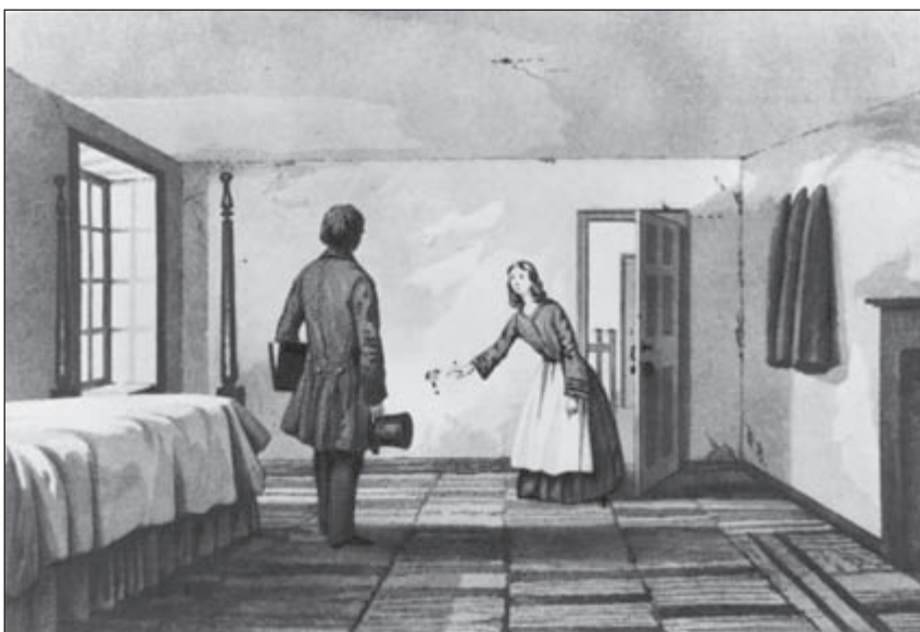
CARTHAGE JAIL ROOM