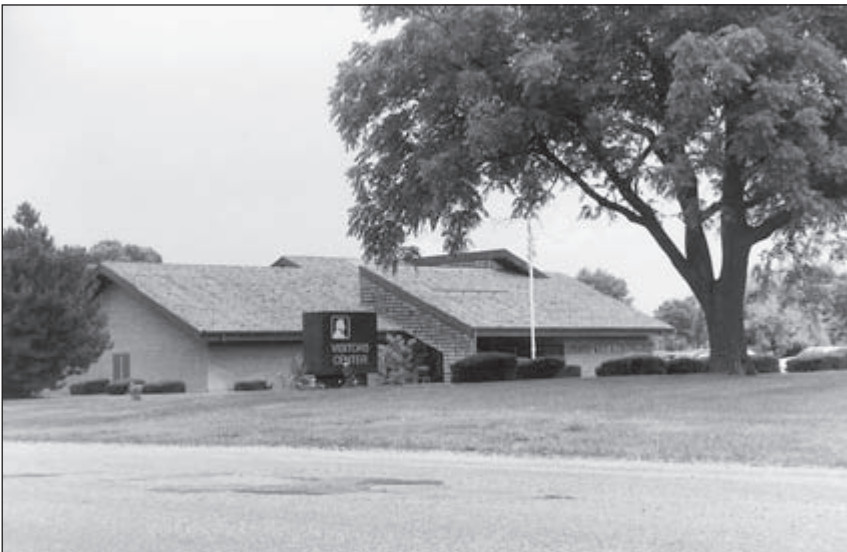
JOSEPH SMITH HISTORIC CENTER (RLDS)

new life to old Nauvoo. Each center has fine displays and programs and should be visited. Many of the restored pioneer shops and homes are located near them.