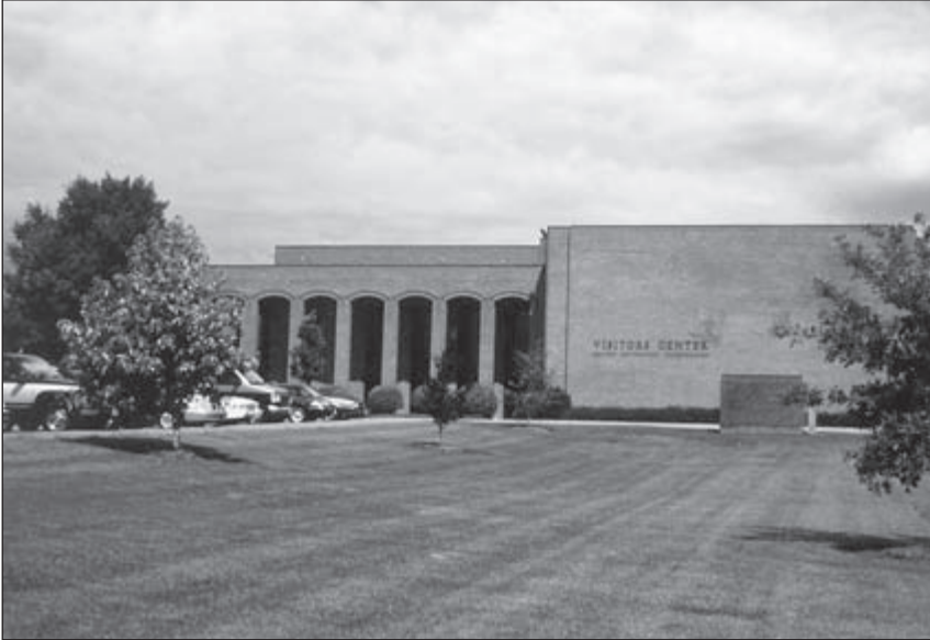
NAUVOO WELCOME CENTER (LDS)

Both the Church of Jesus Christ of Latter-day Saints and the Reorganized Church of Jesus Christ of Latter Day Saints have visitor centers in Nauvoo. Both have been active in restoring