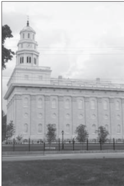
NAUVOO TEMPLE