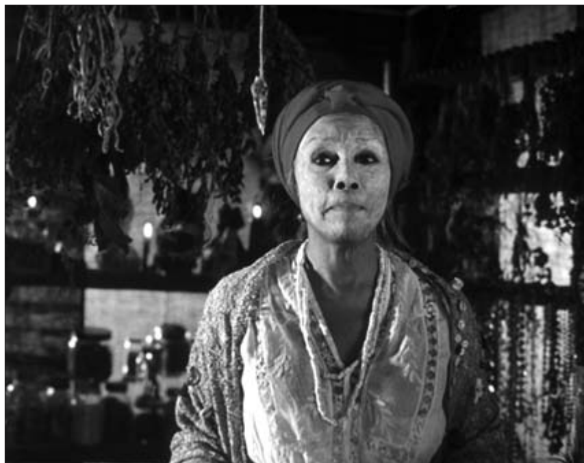
Diahann Carroll as Elzora.

conclusions. Was it the twenty dollars and the bit of hair from his comb that began Louis's demise, or was it the words Eve deposited into the psyche of Mr. Mereaux? We are left to wonder whether it is Eve or Elzora who casts the spell that kills Louis Batiste. Perhaps it is the combination of the two. Or perhaps it was Louis who, as Elzora predicted, "fell on his own sword."