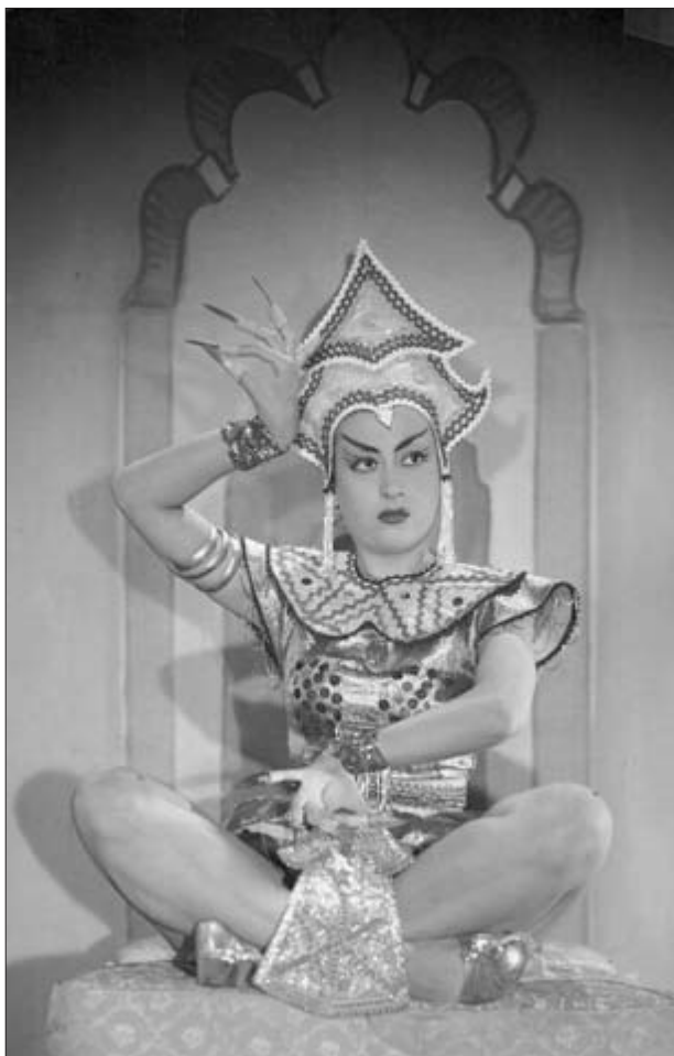
Genie from an unidentified Egyptian film ca. 1950.