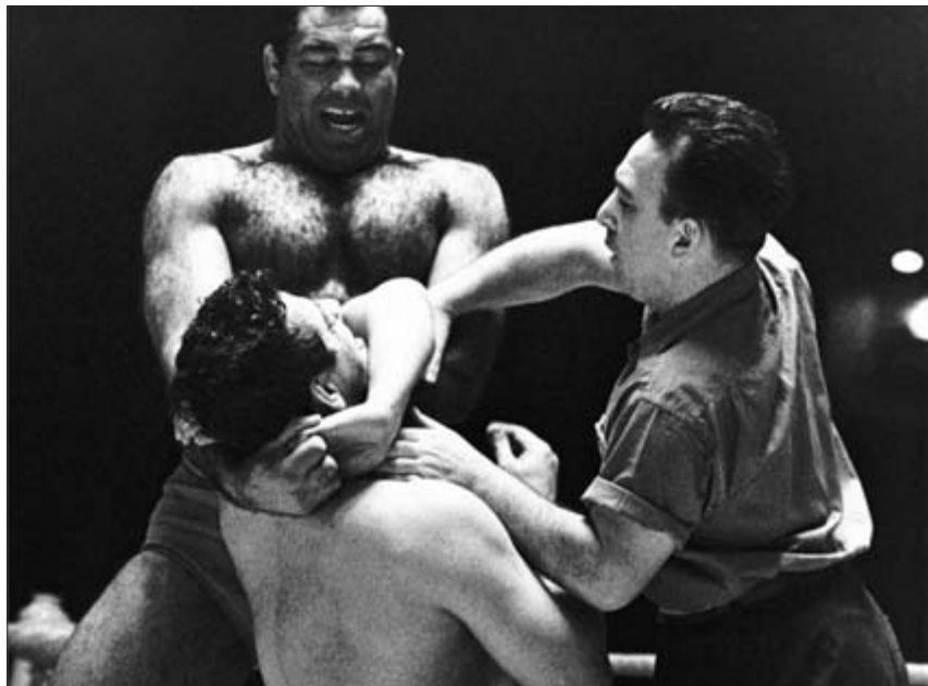
In La Lutte , the ethereal effect of the powerful lights shining down on the ring enhances the mythical significance of the wrestling match.

over neighboring structures and visible from afar. In the films, images of the church and religious ritual suggest that the Catholic faith is still a tangible presence. For example, in À Saint-Henri , a shot of a neighborhood church echoes images of country churches in traditional landscape paintings and on picture postcards. However, the rural church's typically bucolic décor of interlaced pine branches has been replaced here by overhead power lines and streetcar wires. Another striking religious reference in the film is the twilight radio broadcast of le chapelet (the rosary): as the camera pans over the houses of Saint-Henri, we hear the familiar litany; by means of this nightly religious ritual, the community's collective culture and identity are continually reaffirmed.