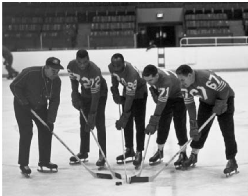
In Un jeu si simple , the hockey arena provides the venue for a ritualized folk performance.

the arena that encircles the wrestling ring and hockey rink in La Lutte and Un jeu si simple ; and in the rows of seats facing the theater stage in Margaret Mercier .