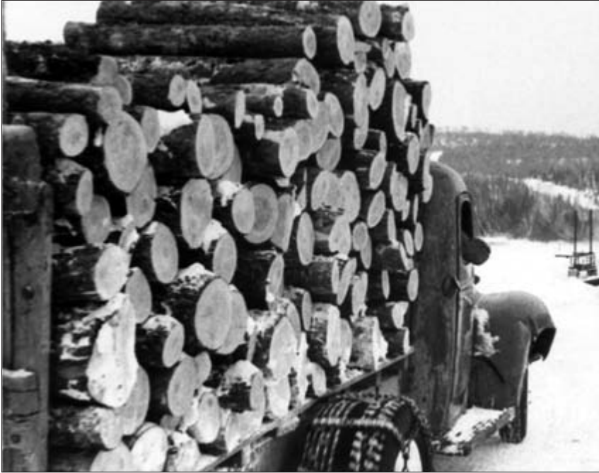
Bûcherons de la Manouane intercuts shots of modern technology with those of traditional logging methods.

powerful overhead lights creates an ethereal ambience that enhances the mythical significance of the wrestling match.