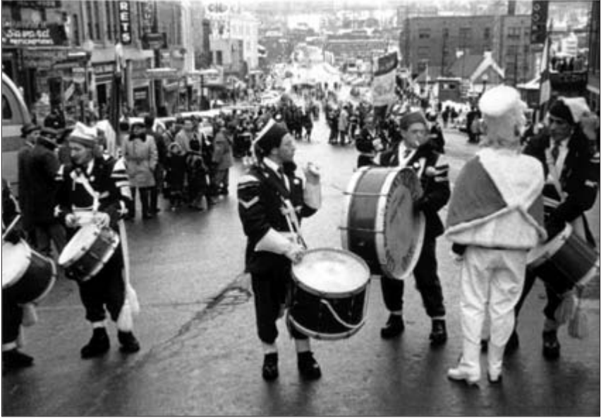
The “habitant” costume of the snowshoers in Les Raquetteurs reaffirms the festival’s celebration of collective Québécois identity.

and resourcefulness in negotiating the backcountry and instantly recognizable in the unique apparel which represents their métier or vocation. These include the famous voyageurs , or “canoe men” of the North American waterways, with their buckskin jackets and coonskin caps; the bûcherons (loggers), with their axes and red-and-black-plaid lumberjackets; and the coureurs-des-bois (outlaw trappers and poachers); and habitants (settlers), dressed in their tûques (long woolen caps), capôts (parkas), and ceintûres fléchées (embroidered cloth belts with arrow patterns). This habitant costume is an important feature in Les Raquetteurs : as the official apparel of the participating snowshoe clubs, the costume underscores the significance of this annual congress as a ritual reaffirmation of collective Québécois cultural heritage and identity.