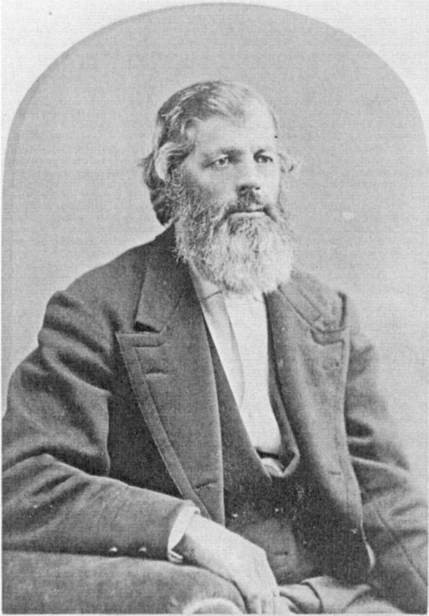
William C. Graves (1829–1907); date of photo, 1879.