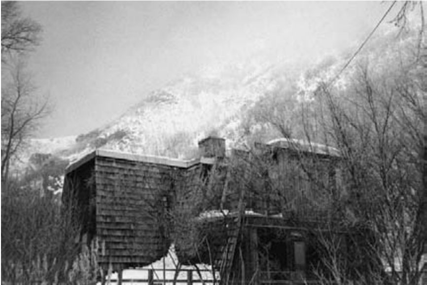
One of my many pictures of the cabin we built in Wildwood, Utah

priest who has welcomed us even though he knows that we are Mormons