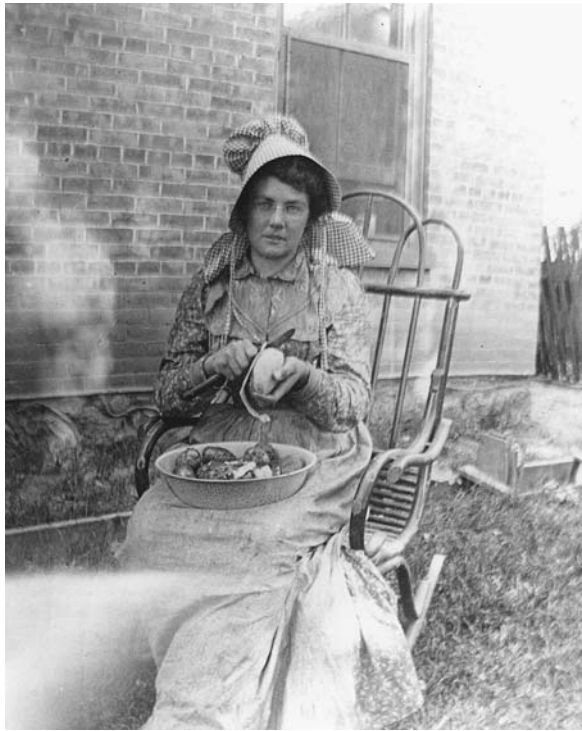
Used by permission, Utah State Historical Society, all rights reserved.

Woman performing the domestic chore of peeling potatoes, Elfie Huntington, photographer, ca. 1904.