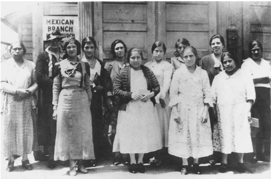
Used by permission, Utah State Historical Society, all rights reserved.

Lucero Ward Relief Society members, ca. 1938.