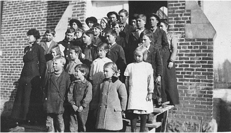
Giovale Library, Westminster College, Salt Lake City.

A postcard photograph of a group of students and their instructors at the Presbyterian mission school of Panguitch, ca. 1920.