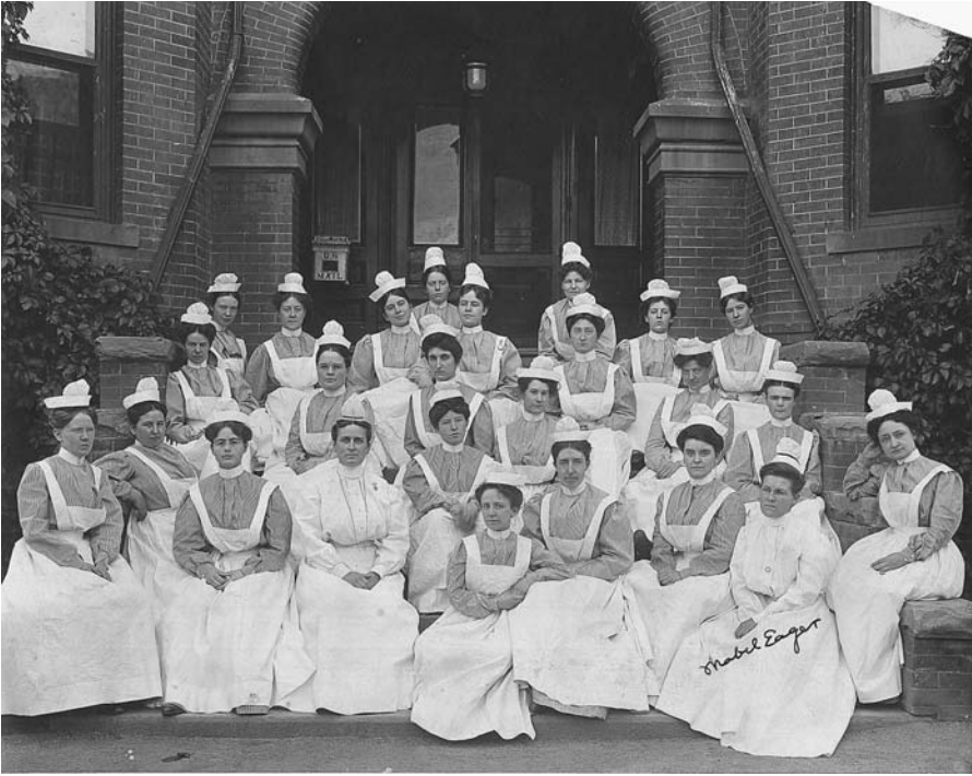
Giovale Library, Westminster College, Salt Lake City.

St. Mark's Hospital School of Nursing, Salt Lake City, Utah, ca. 1919.