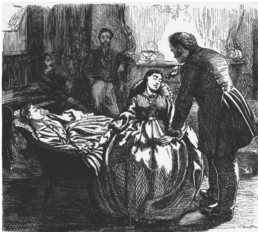
Fig. 7.1. Illustration by George du Maurier, from The Notting Hill Mystery by Charles Warren Adams, Once a Week: An Illustrated Miscellany of Literature, Art, Science, and Popular Information 7 (1862): 645.

trude Anderton, William Anderton, Madame Rosalie) are murdered by the Baron and, notably, the two female characters are murdered through mesmeric means. Peculiar susceptible to the Baron's powers, Gertrude belies her extreme capacity for physical sympathy with his very first mesmeric experiment. "He certainly is powerful," she writes in her diary, "for he had scarcely made a pass over me before I felt a glow though my whole frame." 34 Though Gertrude seems anxious about the Baron's power, she quickly responds to the pass and allows herself to sympathetically meld with the Baron—unwittingly (and self-destructively) yielding to his desires and accomplishing his pecuniary goals. It is worth noting that early in the novel, the Baron, though aware of Gertrude's inheritance and that Gertrude and Rosalie are estranged identical twins (a fact that curiously eludes every other character in the novel), is unable to figure out how to secure Gertrude's money for