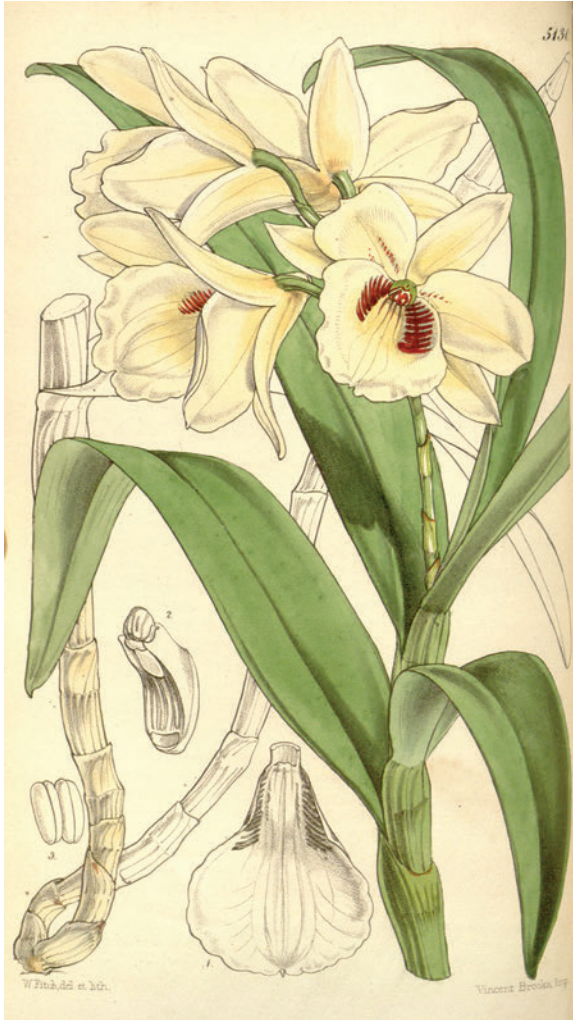
Fig. 1.1. Dendrobium Albo-Sanguineum , Curtis's Botanical Magazine 85 (1859): Tab. 5130.

empire characteristic of nineteenth-century culture at large. Plant hunters, for instance, often exhibited a blatant disregard for the effects of large-scale plunder in their pursuit of lucrative species. One collector, in search of Odontoglossum orchids in a dense Andean forest, describes the methods he used to secure specimens “high up out of reach of the native climbers.” With his goal of gathering as many plants as possible, he “provided [his] natives with axes and started them out on the work of cutting down all trees containing valuable orchids.” After about two months’ work, he concludes, “we had secured about ten thousand plants, cut-