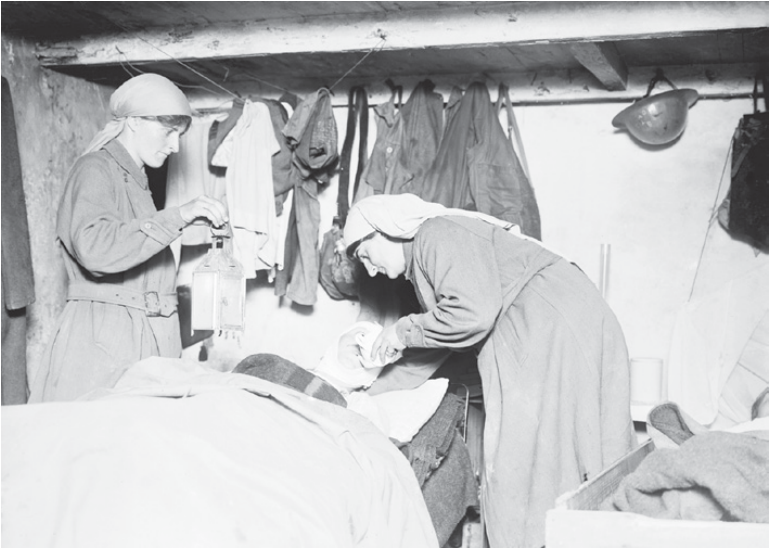
Figure 8 Elsie Knocker and Mairi Chisholm attend to a patient in their Cellar-House in Pervyse

of the line was quiet, and the two women treated numerous cases of minor illness or injury. At times, though, they participated in the evacuation of serious casualties during the ‘rushes’ created by failed assaults on the front line. Knocker also became adept at tooth extraction after the British Red Cross Society sent her a complete set of dental instruments. Her fame as a dentist – by her own account – ‘spread far and wide.’ 11 In 1916, Arthur Gleason, who had worked for five months as a volunteer for Hector Munro’s Flying Ambulance Corps, commented that the women had been warned that their sector of the line would, eventually, come under severe attack and might be ‘wiped out’. He also observed that their response was simply to ‘go on with their cool, expert work’, adding: ‘The only way to stop them is to stop the war.’ 12