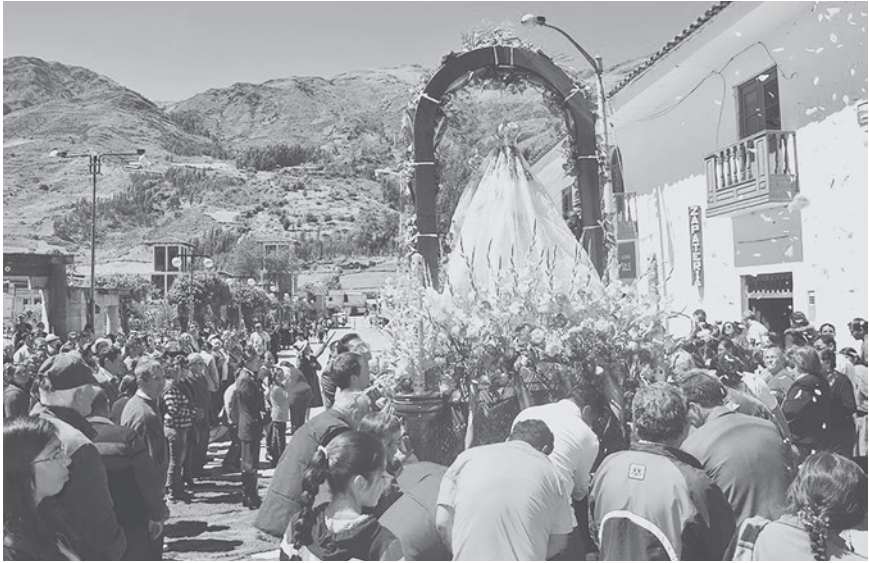
FIGURE 1.1. Procession of Virgen del Carmen, Chavín de Huántar, Peru, 2015