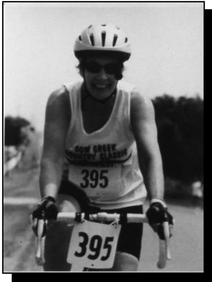
The author riding in the Hottern Hell Hundred, Wichita Falls, Texas