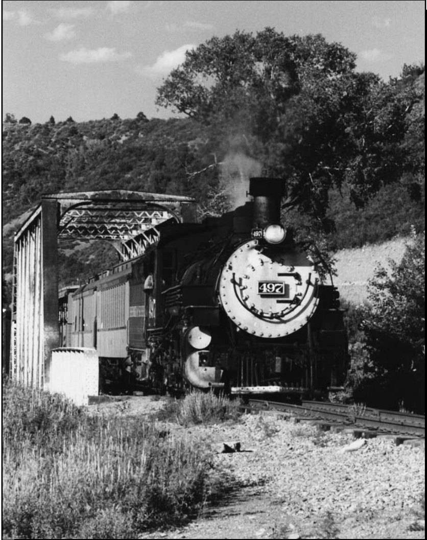
The Durango and Silverton train