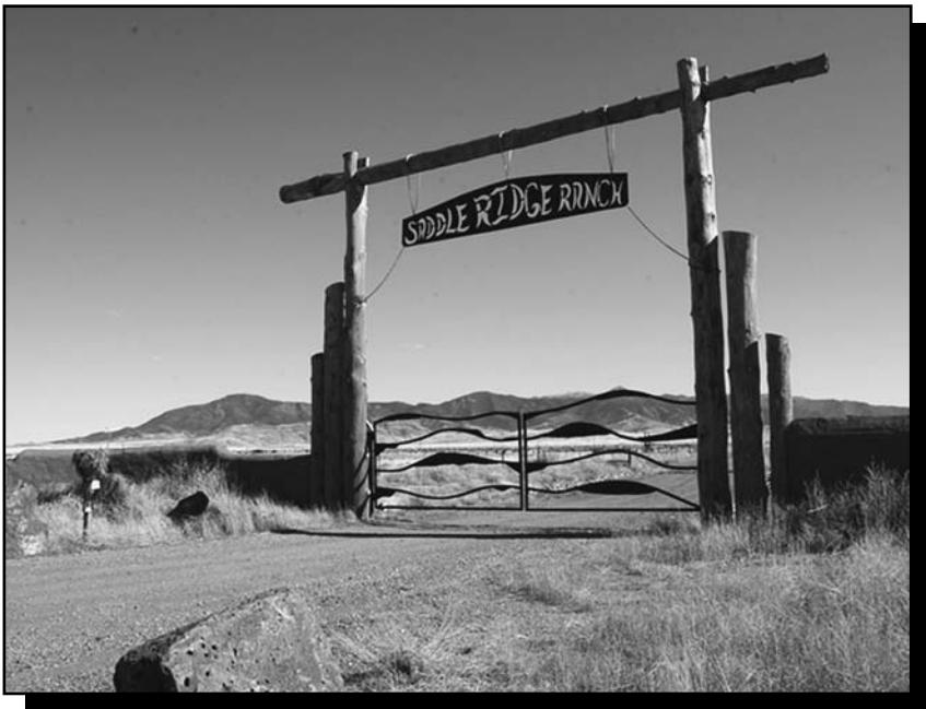
Incorporating native materials to supplement design

In fact, using native materials is one of several important characteristics of the entrances. Where there is abundant rock, the rock entries dominate. Types of wood used in building them depend on the region. When wood or rock (other than caliche) are not available, brick or stucco entries are plentiful; or, when there is an