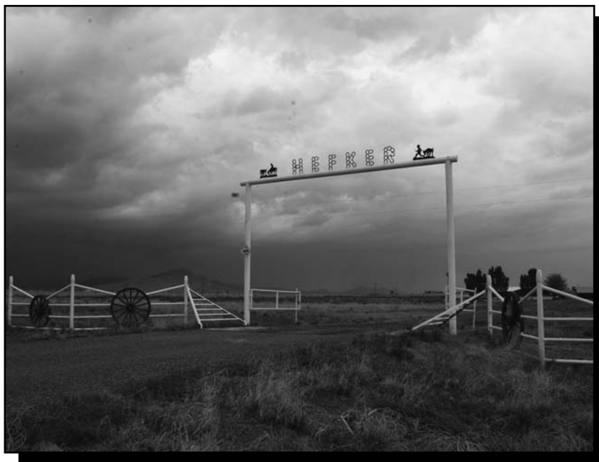
Functional and personal

I might add as a footnote, that my husband, our son, and I traveled to the East Coast, then New England and eastern Canada one summer. And another summer, we traveled the entire West Coast and some of western Canada looking for entryways as we went. We saw very few in our informal survey.