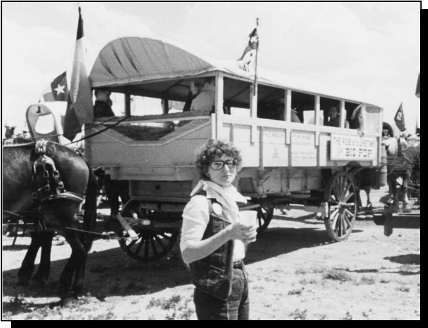
The author, during a water break, beside the Big Pop wagon