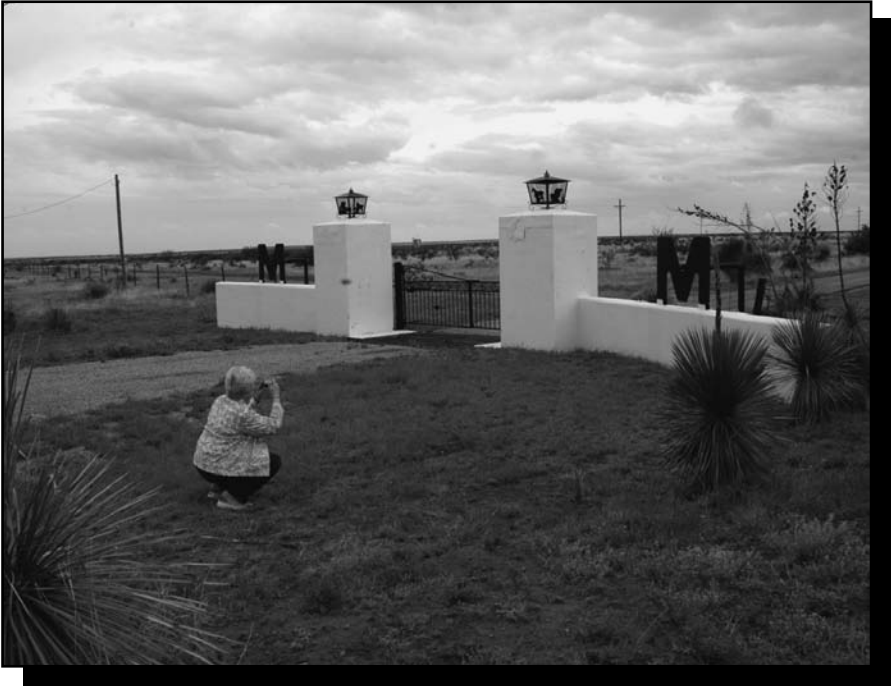
The author doing field research