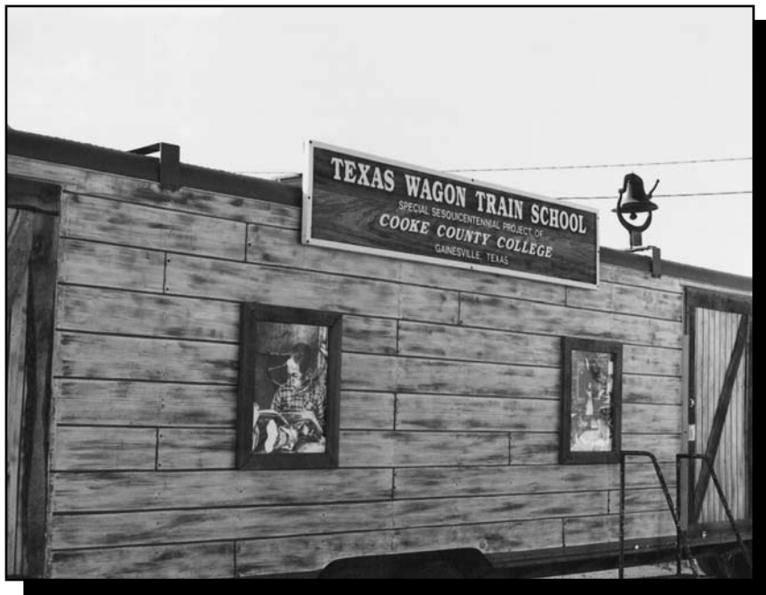
The Texas Wagon Train School, Gainesville, Texas