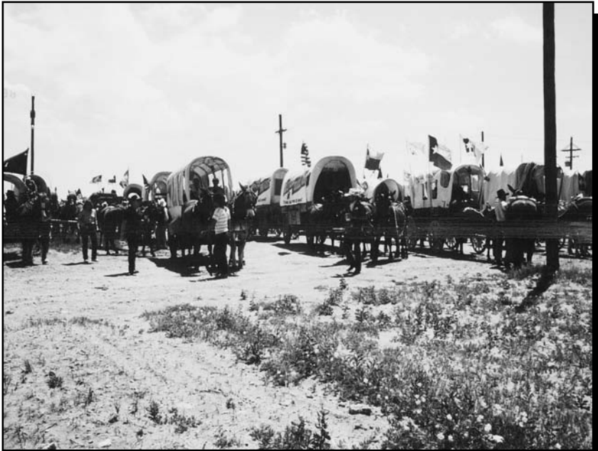
Wagon Train on break, but ready to go