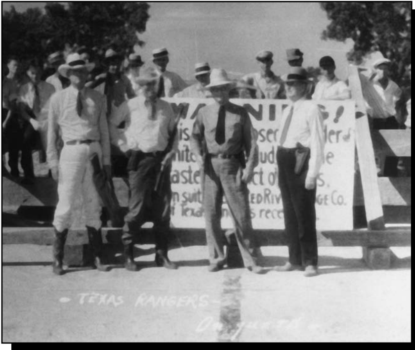
The Texas Rangers arrive

At this time the Adjutant General of Texas was William W. Sterling (no relation to Governor Ross Sterling). He accompanied the Texas Rangers to the south end of the free bridge and oversaw the erection of a stronger barricade than the one which had been destroyed by Governor Murray’s men. Displaying a sense of humor as well as downplaying the seriousness of the “bridge war,” Adjutant General Sterling sent a message to Murray, which can be paraphrased as follows: “If you are sending a brigade of Oklahoma National Guardsmen to the free bridge, I will have the four Texas Rangers remain on duty there; if you send only a regiment, I will allow two of the Rangers to return to Austin.” He then returned to Austin and directed operations from there.