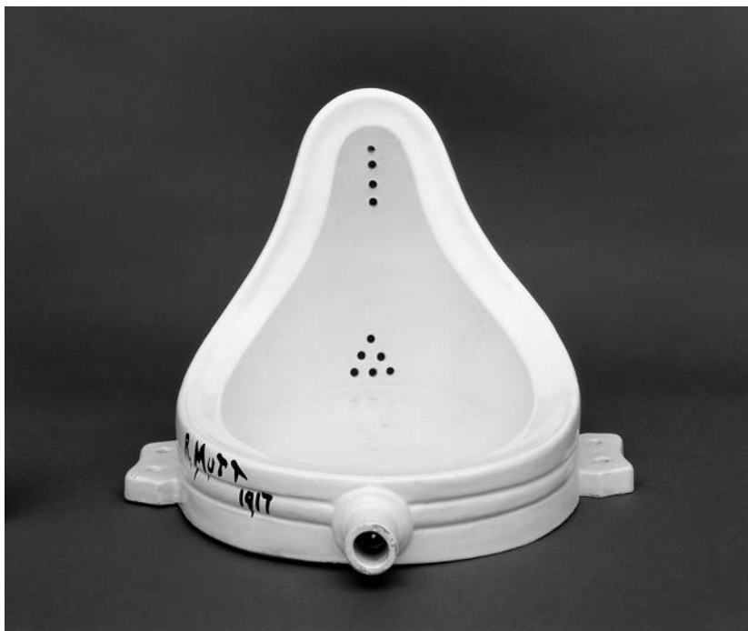
FIG. 1.3 Marcel Duchamp, Fountain , 1917, replica 1964. Porcelain, unconfirmed: 360 × 480 × 610 mm. Tate Gallery, London. Purchased with assistance from the Friends of the Tate Gallery 1999. © ARS, NY.

was considered so outrageous that it was hidden from view at the 1917 exhibition of the Society of Independent Artists while it is currently established as a classic work of high modernism, if not as a landmark of twentieth-century art.