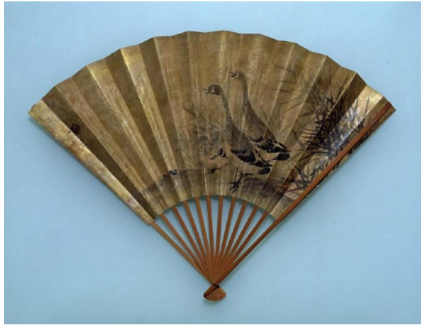
Figure 2. Paper folding fan by Kanō Masanobu 狩野正信 (1434–1530). 18.8×43.3 cm. Collection of Tokyo National Museum.