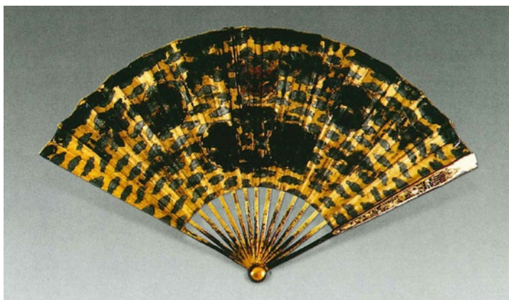
Figure 3. Folding fan with bamboo skeleton and silk paper. 32 × 55 cm. Excavated from the tomb of Zhu Yiyin, King Yixuan of the Ming dynasty 益宣王朱翊鉞 (1537–1603). See Jiangxi sheng bowuguan 江西省博物館, ed., Jiangxi Mingdai fanwang mu 江西明代藩王墓 ( Ming-Dynasty Prince Tombs in Jiangxi ). Beijing: Wenwu Chubanshe, 2010, pl. 62.6.

and imperial family members in the lower Yangzi Delta. At least sixty-five folding fans were found in seventeen Ming tombs, and they were commonly placed near the tomb occupants. Many of the fans were in the Japanese style, with a solid gold ground or with many gold dots spread across the paper surface (see fig. 3; Xia 2008: 79).