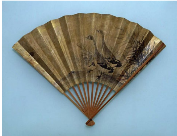
Figure 2. Paper folding fan by Kanō Masanobu 狩野正信 (1434–1530). 18.8×43.3 cm. Collection of Tokyo National Museum.