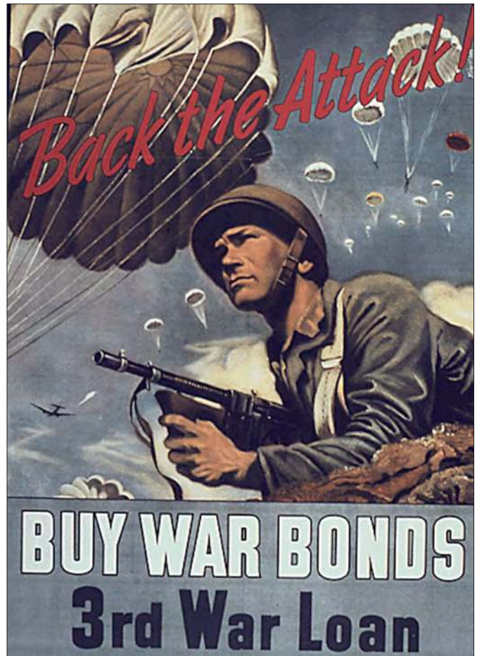
Color poster [513920], "Back the Attack!," World War II Posters, 1942–45, Records of the Office of Government Reports, 1932–47, RG 44, National Archives and Records Administration, College Park, MD The Cutts Compensator became a recognizable feature on the Thompson submachine gun.

Furthermore, malicious characterizations fail to perceive the limitations the Cuttses imposed on their business efforts. A terse exchange between father and