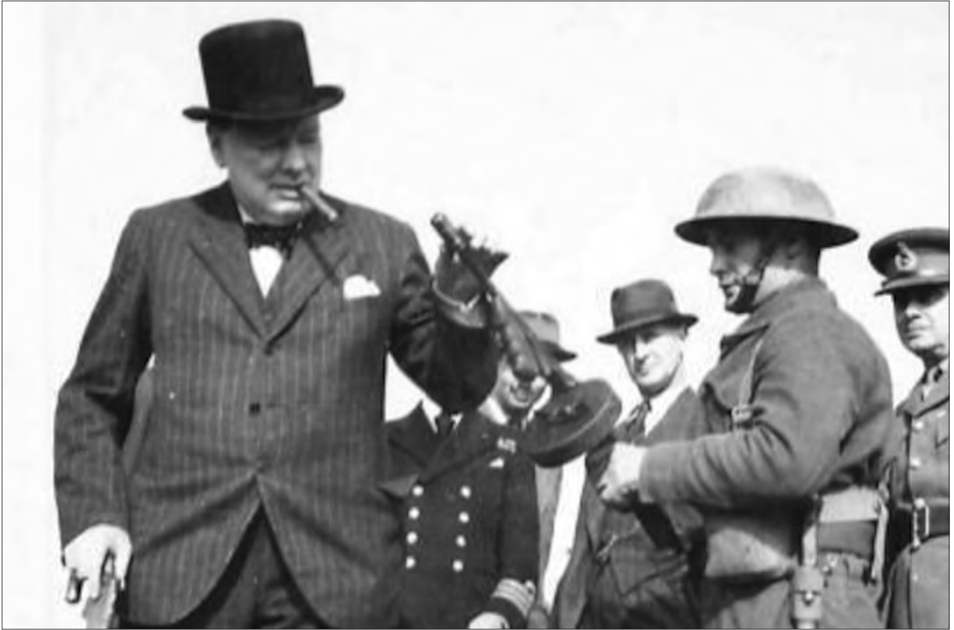
Prime Minister Winston Churchill examines the Cutts Compensator on a Thompson submachine gun, 31 July 1940.

weapons. In one case, the Harrington and Richardson Arms Company manufactured the Model 50 Reising submachine gun with a gas-directing muzzle device. Following a lawsuit filed by Auto-Ordnance in 1942, Harrington and Richardson denied infringement but settled with Cutts Jr. for $17,500. 98 Whether necessary or superfluous in actuality, the presence of imitation compensators indicate that for some weapon developers, compensated guns were viewed as more desirable than uncompensated ones.