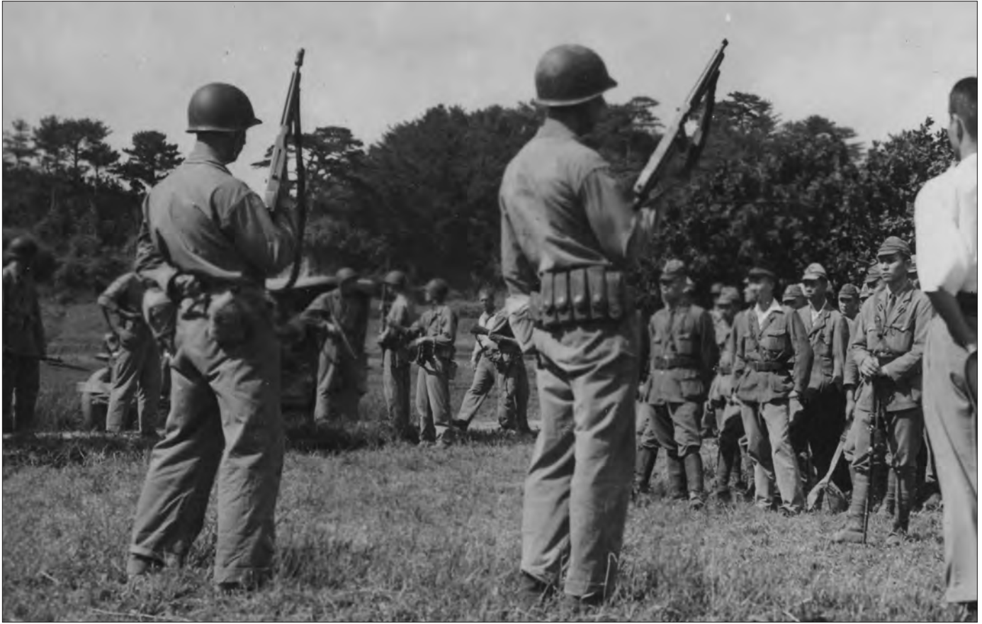
Marines armed with compensated (left) and uncompensated (right) Thompson submachine guns guard Japanese prisoners on Okinawa, 3 September 1945.