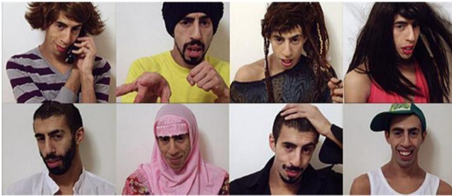
Figure 1: 2FIK, Images of characters in artwork, photo story Identities by 2FIK

The design of the self has a prominent political power in the current society of visual communication. The seemingly innocent question of “where are you from originally” can perfectly conceal and reveal the terms of social inclusion and exclusion but more importantly, when articulated this question mostly brings to light today’s way of identification and identifying one’s politico-ethical stance through physical traits and image setting in public sphere. It remains difficult for anyone to claim to be someone without “performing differences” and “self-design” techniques in public in the contemporary visually abundant society of selfie making. Therefore, the institutional and social surveillance technologies act and react to specific designs and attached information on body traits.