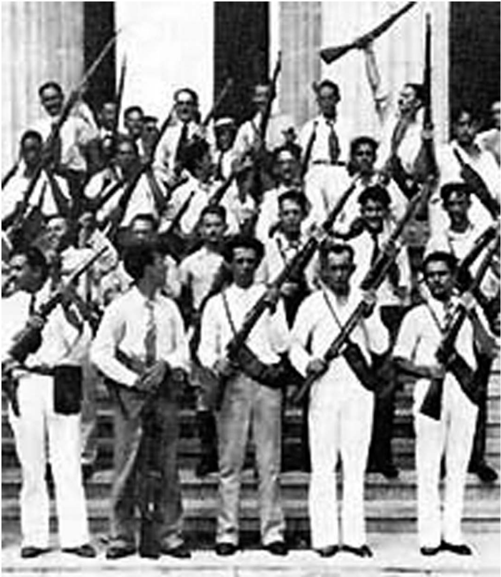
Armed students, Cuba, 1933.

Non-Aboriginal Australians have fought all their wars overseas. Even its first sacred site—Anzac Cove—is in Turkey.