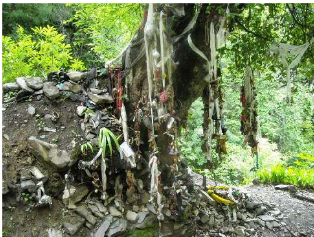
FIGURE 4. A hidden offering site not contaminated by tourist waste, with white scarves and necklaces left by local Tibetans, 2014.

reincarnated forty-nine days after bodily death. Hence, these used garments cannot be classified as trash objects in the waste-management policies of tourist companies. Rather, used garments represent fear of, and protection against, cosmic pollution and thus must be understood as actors that take part in the making of divine worlds.