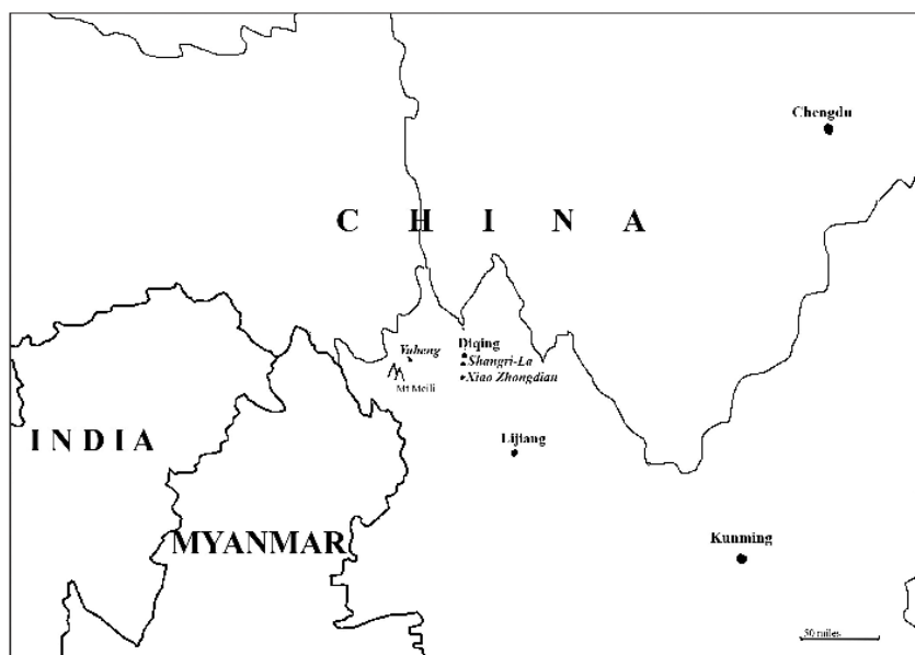
FIGURE 1. Map showing the location of Diqing Tibetan Prefecture, Yunnan, Southwest China, and neighboring India and Myanmar. Shangri-La and Lijiang are two neighboring prefecture seats at the northwest tip of Yunnan. Kunming and Chengdu are the provincial capitals of Yunnan and Sichuan, respectively. In Diqing Prefecture, popular tourist destinations include the Mount Meili region for its glaciers and mountains and Xiao Zhongdian Township for its meadows of wildflowers. Yubeng Village in the Mountain Meili region is also a pilgrimage destination due to its many sacred sites.

Zhongdian, was renamed Shangri-La City. The town took tourism seriously by crafting the land according to the novel's script, building abandoned gold mines, reconstructing plane crash sites, and launching dance shows that retell the story of Westerners' early encounter with this imagined Tibetan sacred place. The tourists who come to experience the fantastic views of this Tibetan town, however, are mainly Han Chinese seeking to escape air pollution and stress. The Han tourists consume the "local culture," along with the beautiful mountains and waters of the area's natural environment. By 2016, Shangri-La City, with a population of only fifty thousand, received over nineteen million tourists and earned 14.1 billion yuan (Diqing Statistics Bureau 2016).