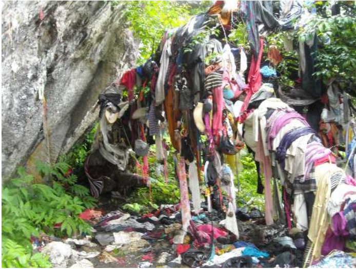
FIGURE 3. Old clothes offered by pilgrims and tourists on a sacred tree, 2012.

money. In a 2015 interview, one government official told me, “We are putting a capitalist spin on Tibetan religious practices and making them the source of profit.”