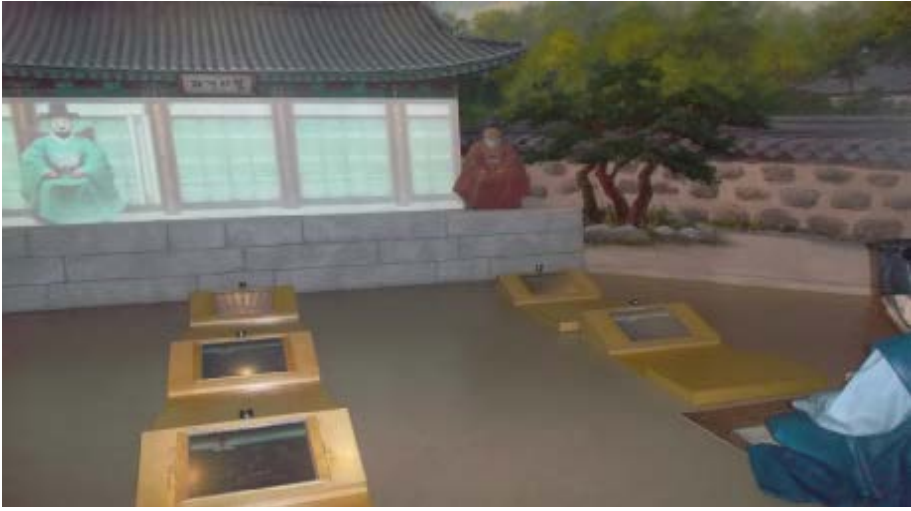
Figure 4. Taking the Confucian Civil Exams at ConfucianLand, 2015.

children can experience Confucianism in a Disneyland-style environment. Visitors learn about the Confucian tradition, its classical texts, history, key figures, rituals, and values, through numerous fun rides (horses, boats), video games, movies, and exhibitions. The park features computers that allow one to input the names of one's family members and receive long genealogical charts; electronic Confucian books, which instead of reading one puts into a machine to receive an illustrated digest; a sort of dancing quiz game, in which you have to step on the right color quickly to answer questions on basic Confucian values; and a plethora of animated movies telling the stories of major Confucian scholars and folk tales emphasizing filial piety. My personal favorite attraction was the civil examinations at the end of the trail, where one sits on a mat in front of a small computer screen and answers questions about the Confucian tradition, according to what one has learned during the visit (see Figure 4). ConfucianLand has only been open for two years, but 120,000 school children have already been taken there, typically on school trips. The kids I talked to when I was there seemed to enjoy it at least as much as I did, and they are likely to grow up with more positive images of their (modernized) Confucian tradition.