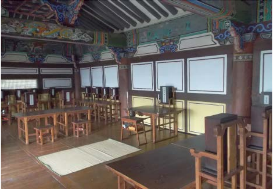
Figure 3. The Classroom-like Shrine for the Confucian Sages at Chinju Hyanggyo

In addition to the large semiannual sacrifices in honor of Confucius ( Sökchönje , 釋奠祭), which have been continuously performed both at the central shrine in the capital and at some of the hyanggyo throughout the twentieth century, many of the local schools today have also reinstated the twice-monthly memorial services ( Sangmangje , 朔望祭). For the most part these still draw a rather small number of elderly participants, but in some of the more active hyanggyo (Chinju, Hoedök, etc.) over a hundred people participate regularly, sometimes joined by visiting public school classrooms from the vicinity. Some institutions have also re-instated annual elders' banquets ( Kiroyön , 耆老宴) and "district drinking ceremonies" ( Hyangümjurye , 鄉飲酒禮), catering to the registered members of the local assembly. The Book of Rites explains, rather bombastically, that these ceremonies should be performed in order to maintain the synchronization of the entire cosmic world (Ing 2012, 7 and 25), but nowadays they seem to function mainly as opportunities for local members of the assembly to have a drink and socialize.