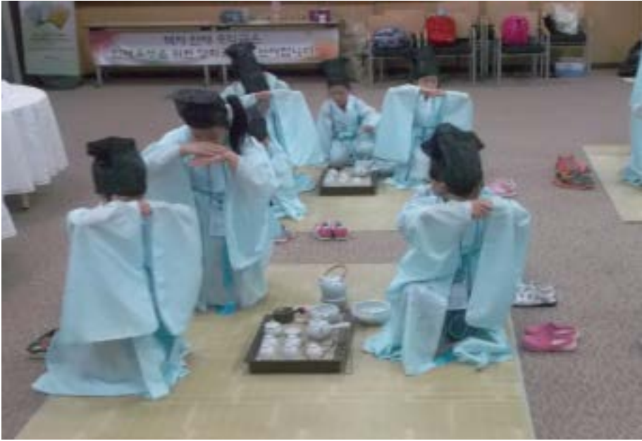
Figure 1. Learning Proper Bowing during the Two-day Decorum Camp at P'iram Sŏwŏn, 2015.

focus on learning how to bow correctly in family rituals and in daily life (see Figure 1), how to behave correctly in hyanggyo , and more general exhortations to be filial, organized, and study hard. Some involve traditional tea ceremonies, traditional games and crafts, folk stories, writing grateful letters to one's parents, and the study of propriety from the Four-Character Elementary Learning . Touristic folk villages have also recently begun to administer such Confucian decorum summer and winter camps for children. The beautiful Village of Confucian Scholars (Sŏnbich'ŏn) near Yŏngju, for example, has had 30,000 children a year coming in for one-to-three day camps focusing on decorum and the Four-Character Elementary Learning since 2014. I participated in some of these programs and found it quite impressive that after just a few hours of bowing and repeating moral adages from the texts, the kids seemed to sit straighter and behave more quietly and maturely all on their own.