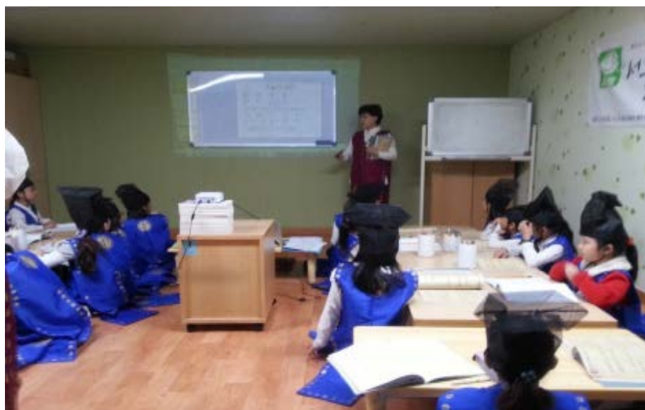
Figure 2. Elementary School Children Studying the Great Learning in the Kangnam Public Library, Seoul, 2015.