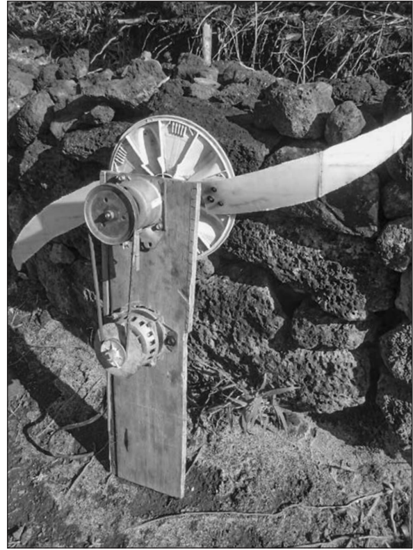
Figure 7. The wind turbine designed and assembled entirely from recycled materials by TAO students.

working with their peers and the engineering program staff. All seven of the engineering students saw their scores improve on the post-test relative to the pre-test, and their feedback on the anonymous evaluation form we collected from each of them about the engineering program was overwhelmingly positive. Students cited the projects they worked on, the evening talks, the excursions, and the time they spent making new friends as positive aspects of the program, and all seven students indicated that they would like to come back next year if they had the opportunity. We found the engineering curriculum to be an ideal complement to the traditional archaeology curriculum, and that students benefited greatly from an immersive experience working on hands-on engineering projects while exploring the island's natural and cultural resources in excursions.