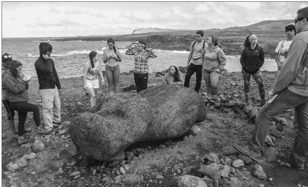
Figure 1. TAO students and staff visit Ahu Akahanga.

For two weeks, TAO students and staff lived and worked together, camping on land provided by Explora Hotel and Mike Rapu. In addition to the activities and projects specific to the two tracks, the entire TAO cohort participated together in a number of excursions, activities, hiking trips, and a series of eight evening lectures by experts on the island’s history, geology, wildlife, and archaeology (see Figure 1). The immersive nature of the program, and the sense of community it fosters among the participants, enables