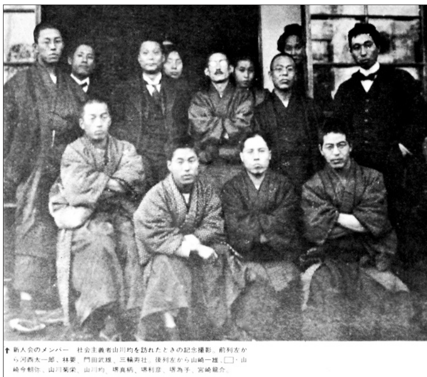
FIGURE 1. Group of young Japanese socialists. Yamakawa Hitoshi is in the upper row, third from left.

changed, in part due to the departure from the JCP of its early theoretician Yamakawa, and in part because of Japan's growing commitment to imperialism on the Asian continent. Assistance to the Chinese Revolution—one of the Comintern's main international slogans—emerged in 1927 as the primary objective of the JCP. Faced with the new critical situation in Asia, the Japanese Left began to regard China and the Chinese Revolution as the only path for liberation, not only of Asia but of Japan as well.