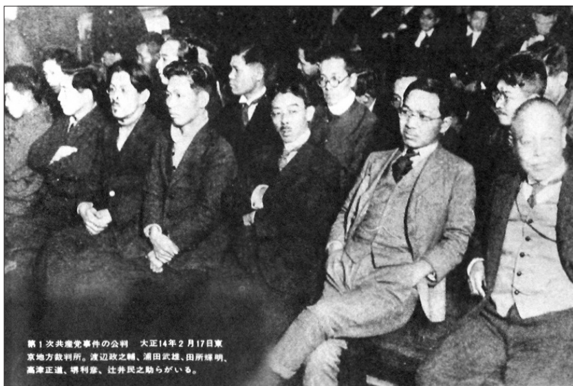
FIGURE 2. The early JCP on trial, February 17, 1925.

The Comintern's ambivalence in regard to Japan is particularly well reflected in the following incident. In February 1926, at the 6th Enlarged Plenum of the ECCI [the Executive Committee of the Communist International], the Japanese delegation proposed to move Japan to the Anglo-American regional secretariat because, they argued, Japan's conditions were different from those in colonial and semi-colonial countries and more closely resembled the advanced capitalist stage of Western European countries. 13 The Japanese delegation, led by Kazuo Fukumoto (1894–1983), the new leader of the Japanese Communists, insisted that Japanese capitalism had entered its final stage, characterized by the creation of a fascist dictatorship. However, the Comintern leadership chose to keep Japan under the eastern branch of the Comintern. Voitinsky's suggestions, outlined in the Shanghai Theses of 1925, were not taken into consideration.