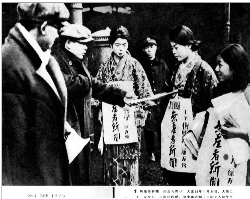
FIGURE 5. Women distributing the Communist newspaper Musansha shinbun on the streets of Osaka, January 9, 1926.

1927. The league was officially formed by three legal proletarian parties: Shakai Minshū tō (the Social Democratic Party), Nihon rōnō tō (the Japan Labor-Farmer Party), and Rōdō nōmin tō (the Worker-Farmer Party). All three parties had ties to the illegal JCP. The league organized a commission to investigate Japanese military actions in China. Its twelve members were, however, arrested in Fukuoka en route to Shanghai in August 1927.