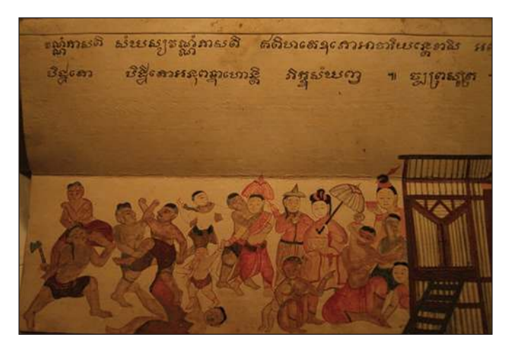
FIGURE 6. Scene of a crowd fighting, laughing, and generally acting badly at the performance of a Chinese opera in Thailand. CB Thai 1330.

table of contents) is in Pali. There is evidence that at least two, if not three different scribes worked on it, and perhaps up to four different artists. However, only one author name appears (Phra Dhammavuddhi Bhikkhu; in a different scribal hand from the text), and there is no date or patron listed. Some paintings were left half-finished. The text and images do not match, and there is seemingly no order to the latter.