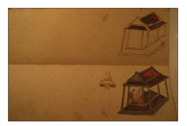
FIGURE 7. Illustrations of unfinished Thai pavilions and monks writing manuscripts from a manuscript catalogued as "Sports and Agriculture Manuscript." CB Thai 1330.

I sat back, scratched my head, and tried to figure out why these random images and two texts might go together. The scribes who worked on the text were well trained. The different scribal hands were all steady. Spelling and grammar had normal inconsistencies found in most manuscripts, but nothing strikingly awful. These scribes were not amateurs. The illuminations were of mixed quality, but not particularly sloppy. One of the painters was very talented in terms of the ability to add detailed patterns to silk sarongs and flower petals. The manuscript was made of high-quality and thick mulberry (khoi) pulp, and the wide variety of pigments used revealed a patron with disposable income. I thought to myself, perhaps some of the scenes like the fighting thugs, drunken or ignorant monks, lecherous men, gambling, and amorous couples were supposed to represent different levels of hell. The story of Phra Malai, which has been popular with storytellers, muralists, scribes, and illuminators for centuries in Thailand, reminds one of Dante's journey past the abyss and into various levels of hell. Although Phra Malai is not led into hell by Virgil, he is a monk who descends into its various levels and sees the contrapasso punishments for those who are greedy, hateful, deceitful, violent, and filled with lust. However, hells are almost universally depicted in manuscripts very graphically, with severed limbs, burning flesh, torture chambers, and voracious animals and vegetation;