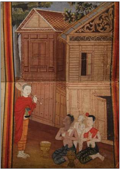
FIGURES 8 (LEFT) AND 9 (RIGHT). Illuminations depicting Phra Malai on his travels through various realms of existence, from an 1897 Phra Malai text. CB Thai 1319.