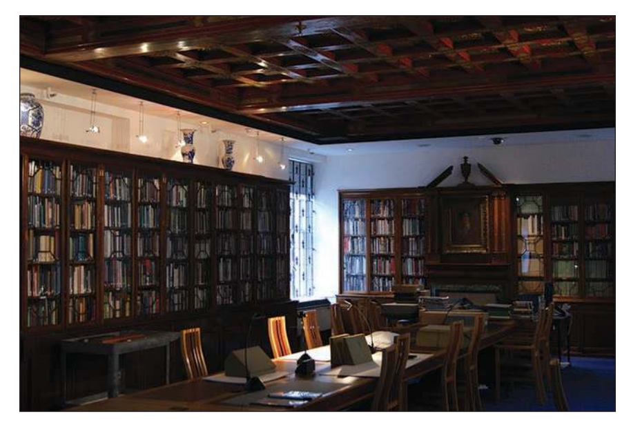
FIGURE 1. Manuscript reading room of the Chester Beatty Library.

where he was able to purchase a large enough estate on Shrewsbury Road in Dublin to house a large portion of their collections. In 1957, after independence from Britain, the young Irish government made Beatty its first honorary citizen. He returned the honor by leaving the bulk of his collections to Ireland upon his death. They sat as an odd curiosity off the well-beaten paths of Dublin's tourist and museum circuit. Even my mother, who grew up in Dublin as a lover of libraries and museums, never visited it. However, that all changed in the year 2000 when the collections were moved to the magnificently renovated and reimagined Chester Beatty Library at the Dublin Castle. Now the material can be examined closely by scholars from many different countries and is appreciated by tens of thousands of visitors a year.