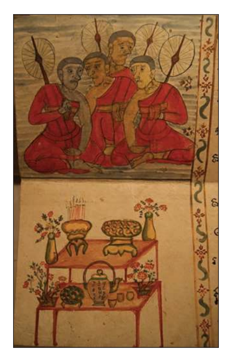
FIGURE 3. Funerary scene of four monks chanting. This painting seems to ridicule the monks, as they are not paying attention to the ceremony and seem disorganized and confused. The bottom panel of the painting is of an offering table with Chinese-style offerings. CB Thai 1330.