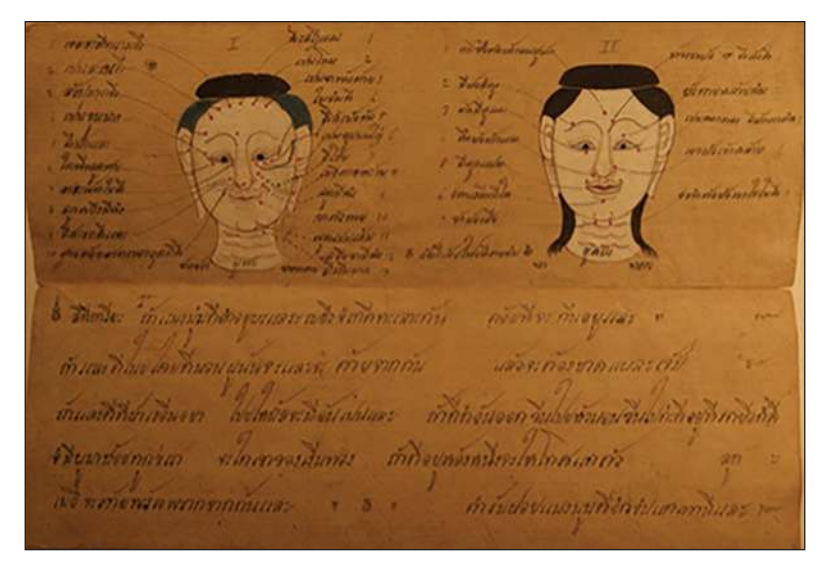
FIGURE 10. Leaf from a Siamese divination manuscript from approximately 1845. CB Thai 1302.

on loose-leaf paper from around 1845 included in the box. The translation, while rough and mistaken in several sections, may have been the first French translation of a Siamese manuscript. At the end of the translation, the translator states that the text was very difficult to read and that he or she abandoned the project before completion. Nearly every translator of Siamese manuscripts from this period ended up doing the same, as they are certainly challenging to read and the divination manuscripts have complex symbols and codes about which there were (and are) few available scholarly reference works and resources. The translation was mostly likely completed before 1847, because the box also contains a letter from the counsel of Portugal dated 1847. Although the author of neither the translation nor the original manuscript is provided, the former could be the work of Bishop Jean-Baptiste Pallegoix (1805-1862), who was the vicar apostolic of Eastern Siam and a close confidant of King Mongkut (Rama IV) of Siam. He was also an accomplished linguist and scholar of the Siamese language, who in 1854 wrote the first Siamese-French-Latin-English dictionary. His dates of residency in