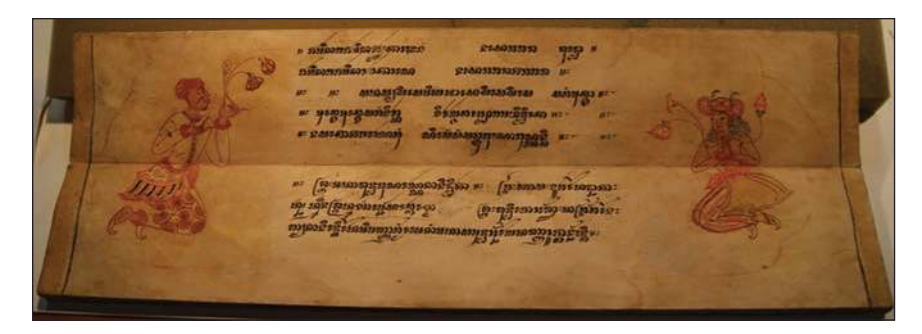
FIGURE 12. Fascinating depictions of kinnara, deer, Persian and Western people, armies of Mara, and several types of flowers. CB Thai 1343.