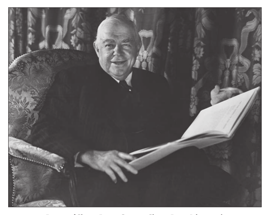
FIGURE 2. Portrait of Chester Beatty.

collection (featuring thousands of pieces from non-Islamic India, Mongolia, China, Japan, Indonesia, Burma, and Thailand) has not been published. However, the Burmese collection has been extensively studied by Sinead Ward and is expected to be published soon. Henry Ginsburg, the late curator of Southeast Asian material at the British Library, undertook a preliminary evaluation of the Thai manuscripts in the late 1990s. He was the first person to inform me of the collection, and his notes proved very useful when I was first opening the manuscript boxes meticulously stored and preserved in Dublin.