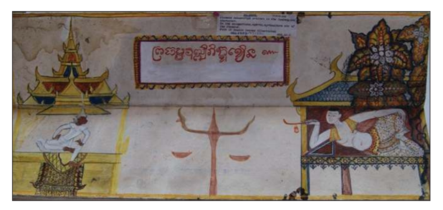
FIGURE 5. A Chinese person smoking opium from a manuscript catalogued as "Sports and Agriculture Manuscript. CB Thai 1330.