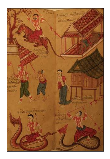
FIGURE 11. Leaf from a Siamese divination manuscript from approximately 1845. CB Thai 1302.

Siam—1838 to 1862—and his access to manuscripts would make him a likely candidate. The use of certain French words to translate Siamese words in the manuscript also closely follows Pallegoix's later dictionary.<sup>15</sup>